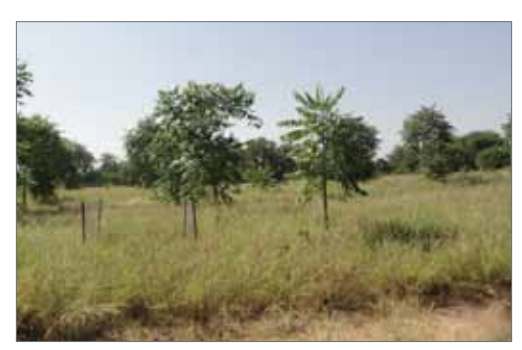
Ailanrhus based silvopasture