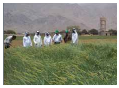
ICARDA Scientist demonstrates the benefits of indigenous buffel grass to policymakers in the United Arab Emirates.