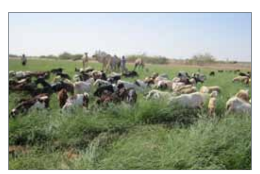
Buffel grass can be directly grazed by all animal species, including small ruminants, cattle, and camels.