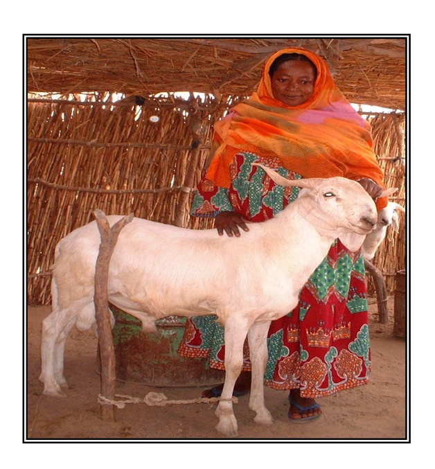
Technical report, November 2015 International Livestock Research Institute, Nairobi, Kenya

<sup>a</sup>Institut National de la Recherche Agronomique du Niger (INRAN), Niamey, Niger <sup>b</sup>International Livestock Research Institute (ILRI), Ouagadougou, Burkina Faso