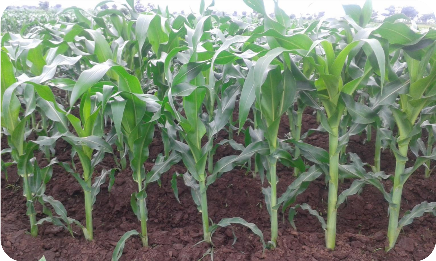
Figure 2a Maize plot before terminal drought