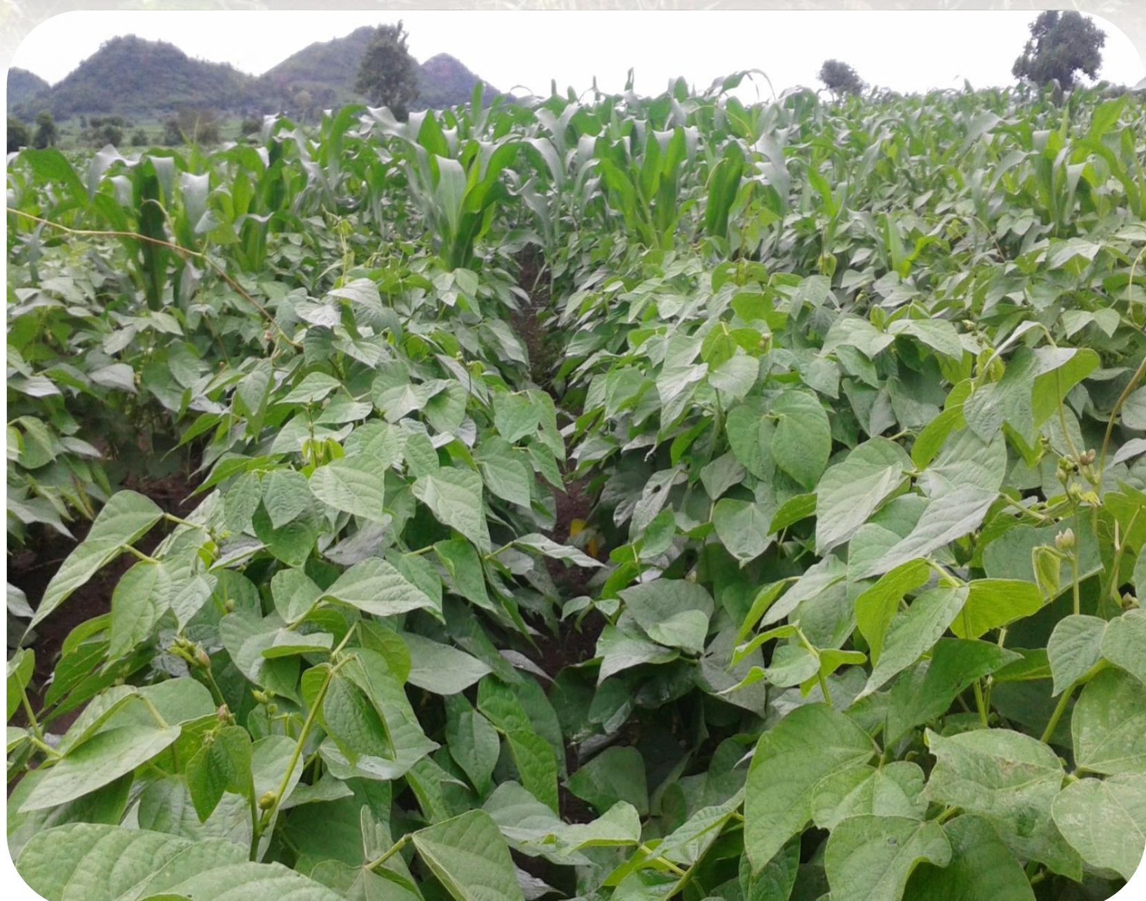
Figure 3a Bean plot before terminal drought

At the end of the season, most plots, particularly those which did not have organic mature as part of the treatments, completely failed (Figure 1b)