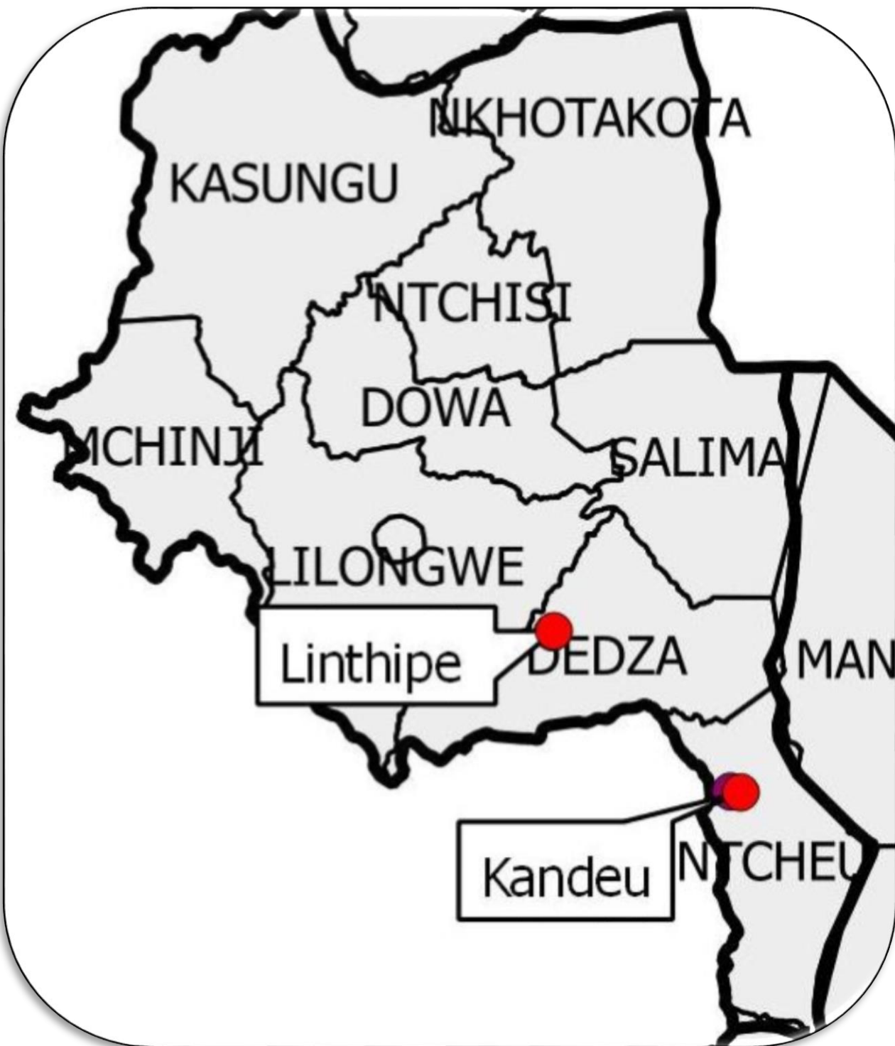
Map of central Malawi showing Study Sites

Participatory Technology Evaluation (PTE) was conducted with both participating and non-participating farmers.