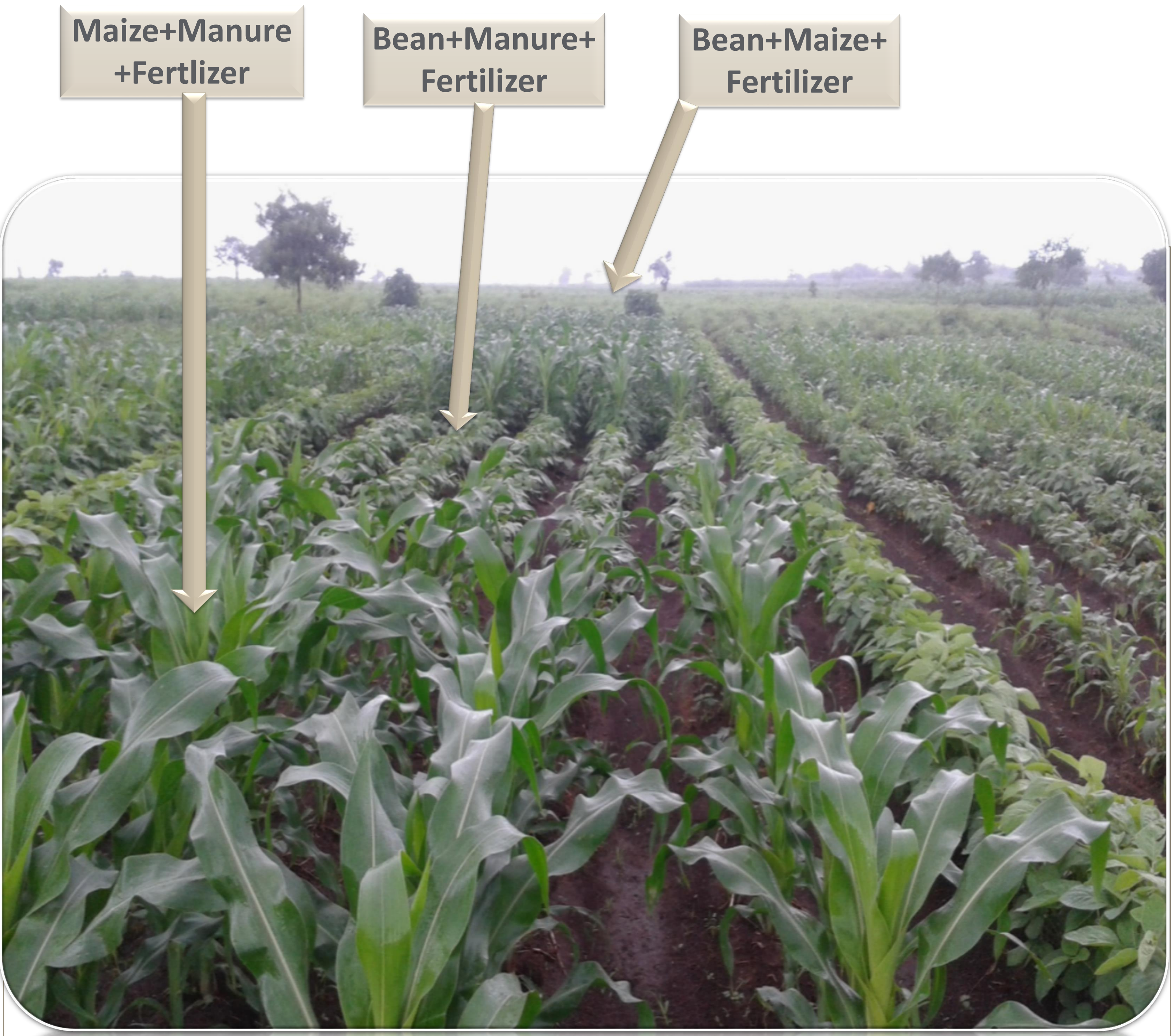
Figure 1: Part of the treatments in a mother trial at Mbibzi in Dedza