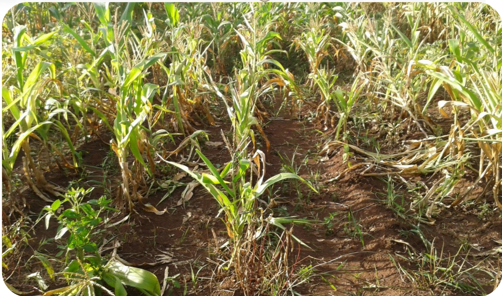
Figure 2b Maize plot after terminal drought

During the early part of the season, maize crop was very promising (Figure 1a).