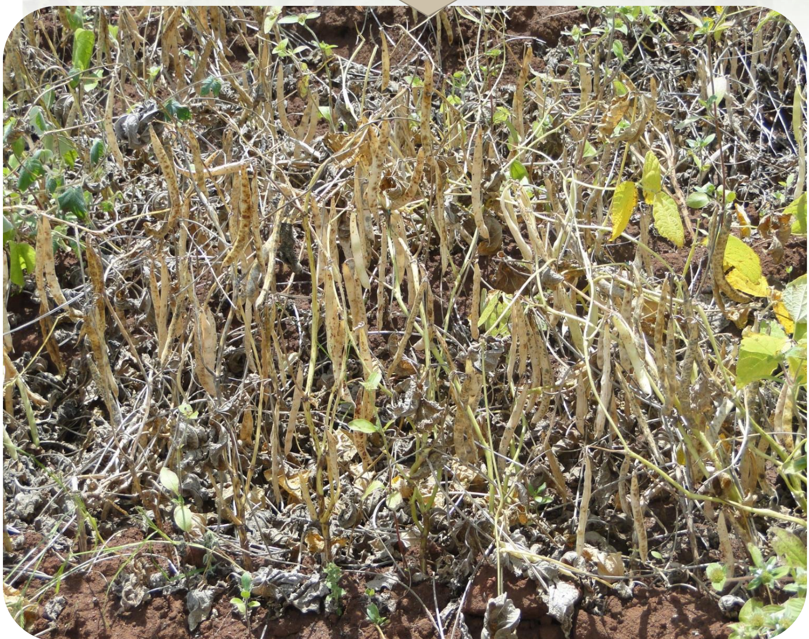
Figure 3b Bean plot after terminal drought

The bush beans showed outstanding performance in all the plots when compared to other crops including the local bean varieties.