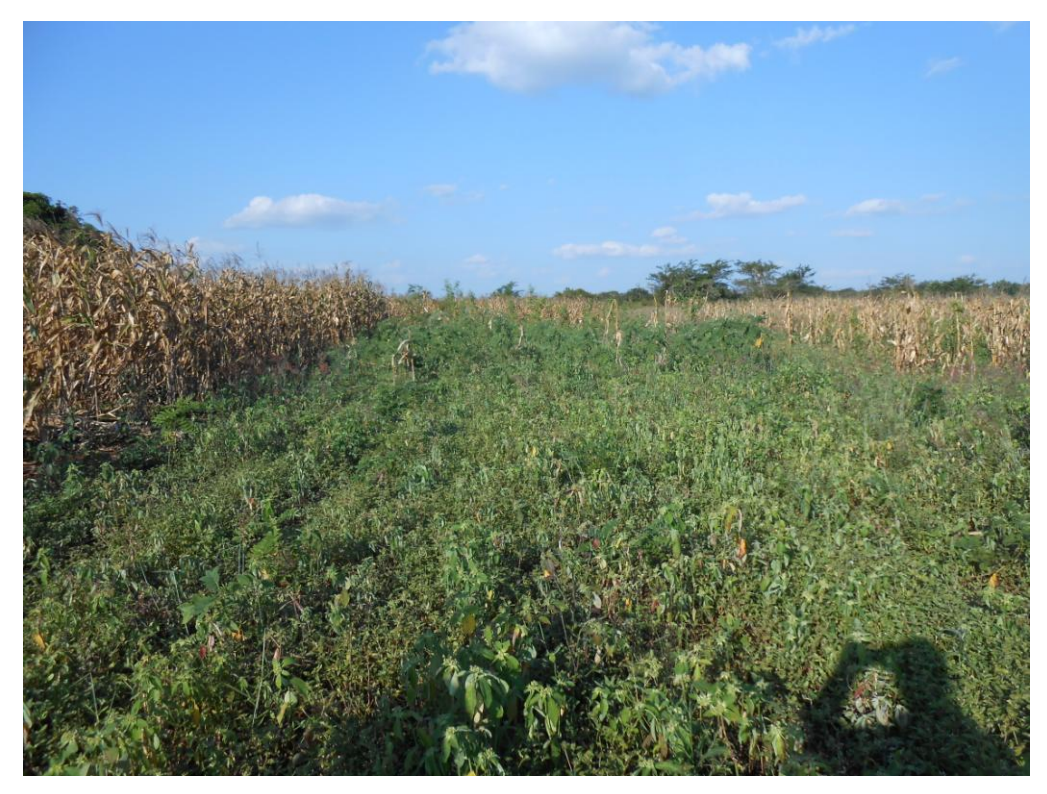
Figure 11: The appearance of Rep 1 at Nyimba FTC just before harvest