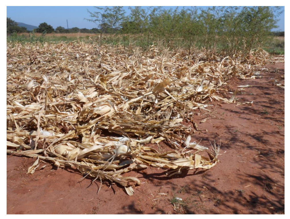
Figure 1: The appearance of a "No Trees" plot after stover management at Msekera

The grains' moisture content would then be measured. Figure 1 shows a plot which had no trees after doing stover management immediately after harvest at Msekera Research Station.