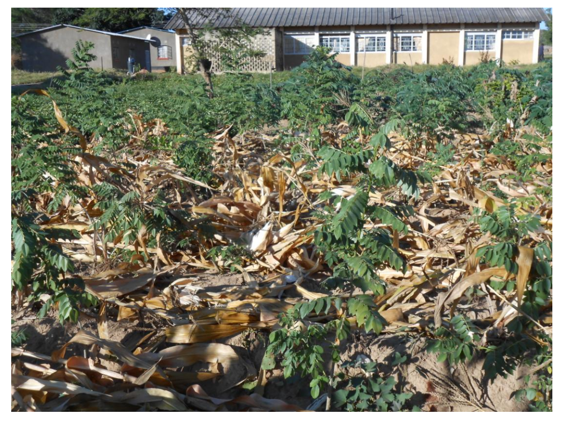
Figure 14: G. Sepium plot after harvest and stover management at Chadiza FTC