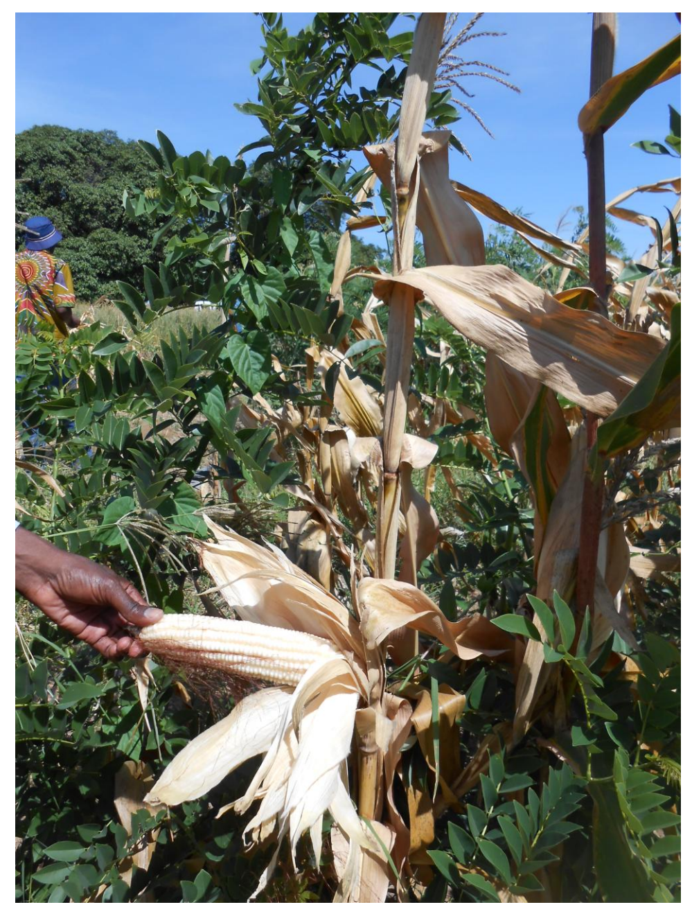
Figure 3: the appearance of most cobs under G. Sepium at Katete FTC

At Katete FTC, the harvest was done on 12<sup>th</sup> May 2015. The crop was not very good because the soil type is sandy and the rainfall pattern was not good. Agroforestry tree establishment was an average. Trees had established but they were not as health as those at Msekera Research Station. The maize harvest procedure which was followed in Katete was similar to the one followed at Msekera Research Station and it is outlined above. Figures 3, 4 and 5 show the pictures captured before and after harvest at Katete Farmers Training Centre.