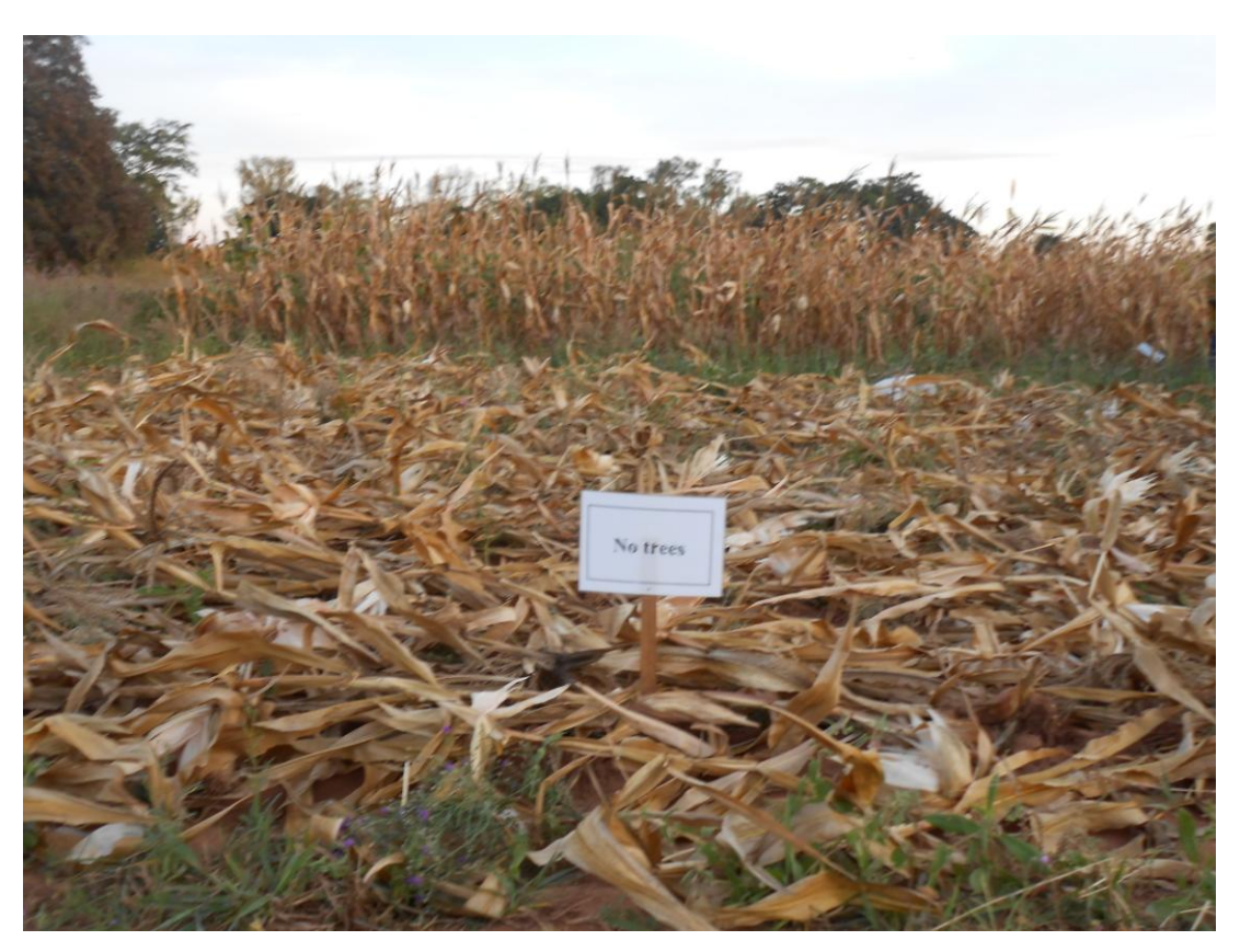
Figure 8: The same plot after harvest and stover management at Sinda FTC