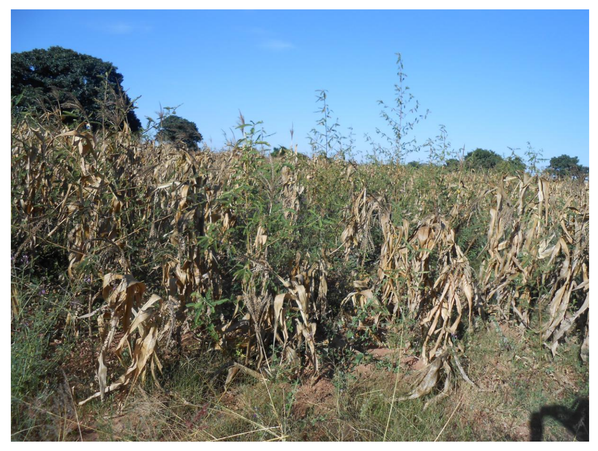
Figure 15: The Appearance Maize Plants At Lundazi FTC just Before Harvest.