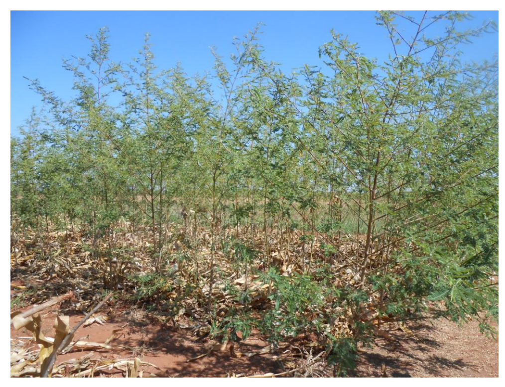
Figure 2: A plot of Sesbania sesban after harvest and stover management at Msekera