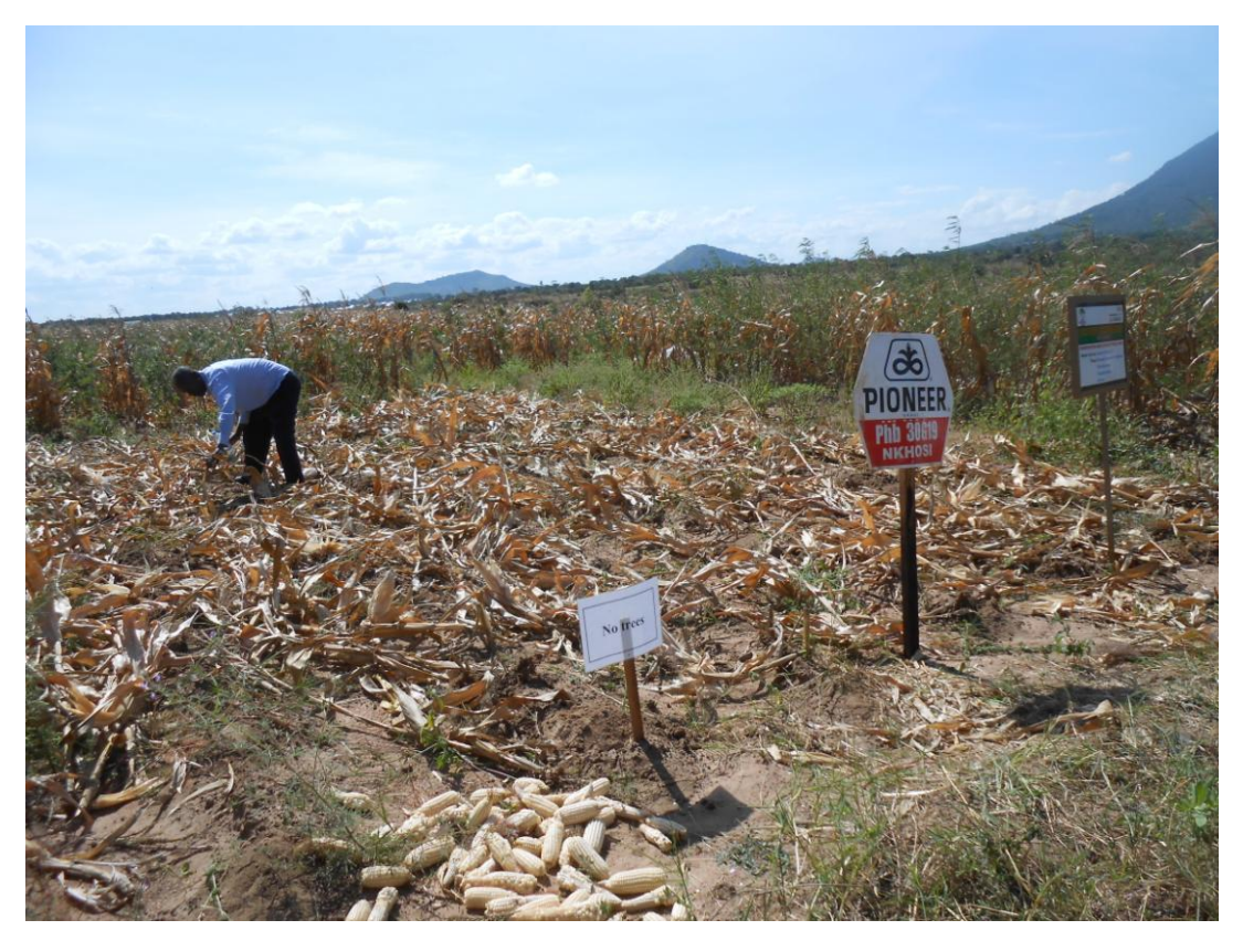
Figure 5: The same plot without trees after harvest at Katete FTC.