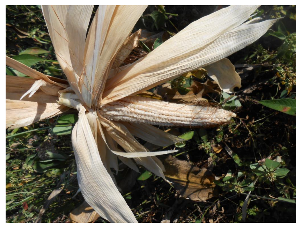
Figure 12: Appearance of some cobs at Nyimba FTC