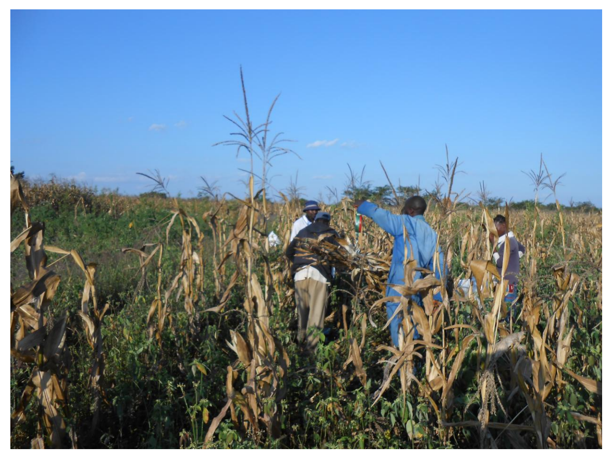
Figure 13: A worker measuring maize stover at Nyimba FTC during harvest.