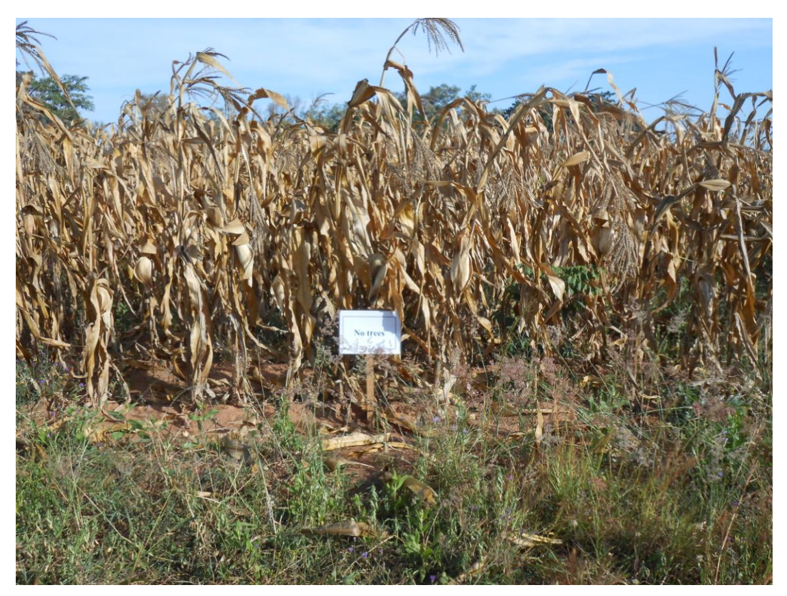
Figure 7: A plot without trees just before harvest at Sinda FTC