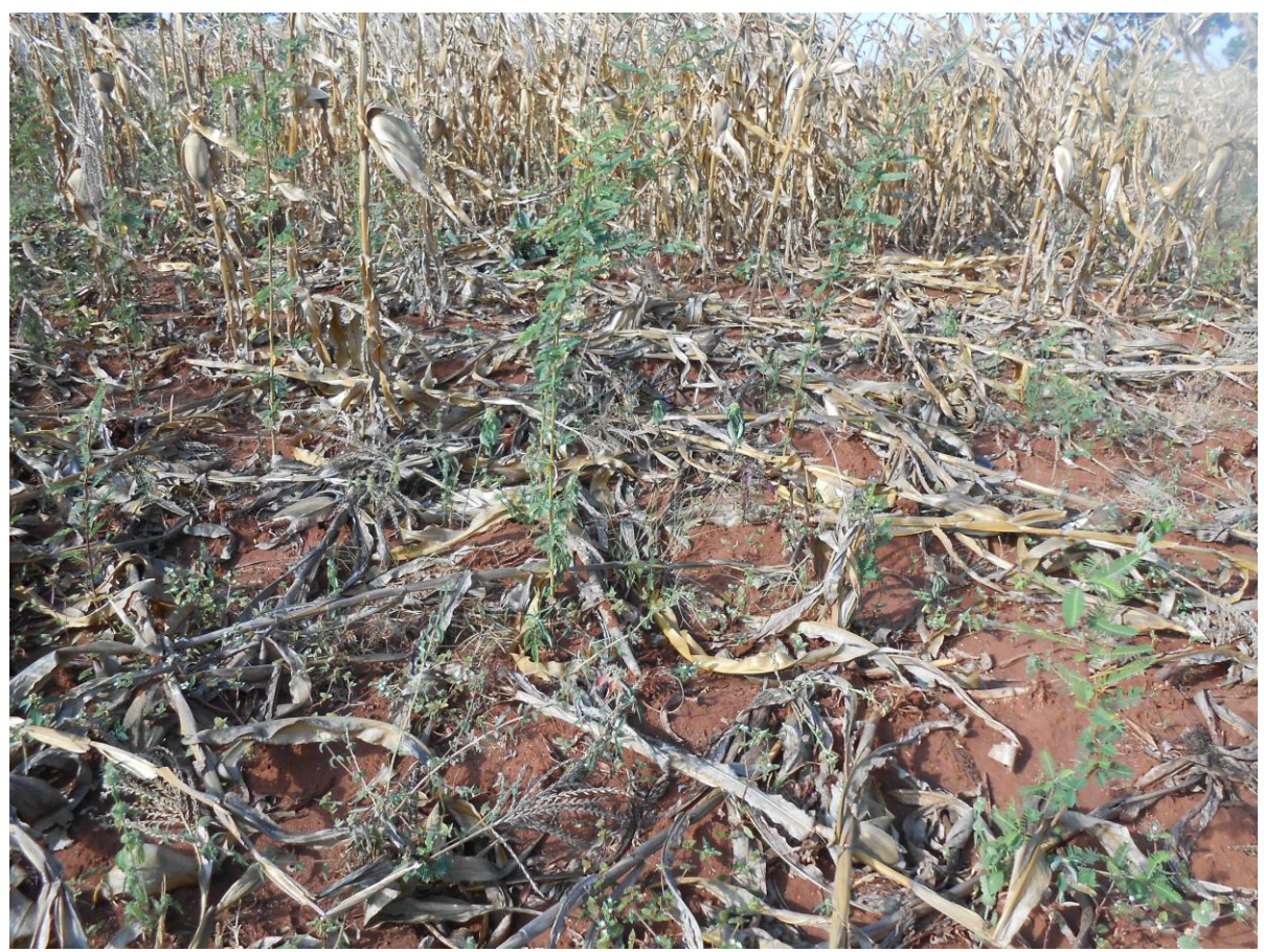
Figure 10: Sesbania sesban plot in Replication 1 before harvest at Petauke FTC