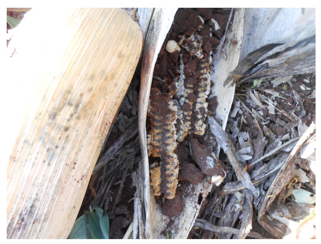
Figure 9: A rotten cob after it had fallen for sometime at Petauke FTC

The harvest at Petauke FTC was done on 13<sup>th</sup> May, 2015. At the time of harvest, it was noted that at Petauke the crop was better than Sinda and Katete. Nevertheless, at some point the drought hit the district and that caused most of the crops to fall and some cobs rot on the ground. On the other hand, just like what happened in Sinda, Petauke too had so many gaps where trees were supposed to be 'gap filled'. Figures 9 and 10 show some pictures captured during the harvest.