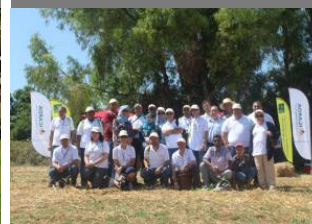
Opportunities for Crop- Livestock In...