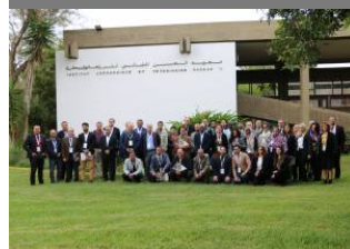
What is Knowledge Management?