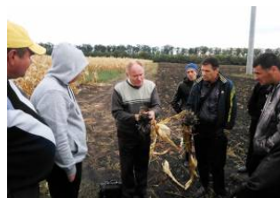
Alternative practices for sustainab...