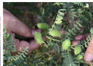
Chickpea: an alternative crop for r...