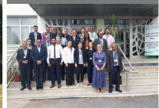
First Step on a Four Years Route to...