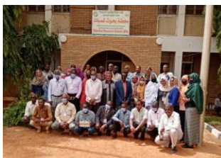
SKiM Knowledge Management Symposium