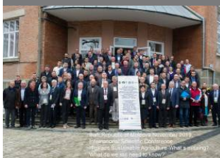
"Towards Sustainable Agriculture ...