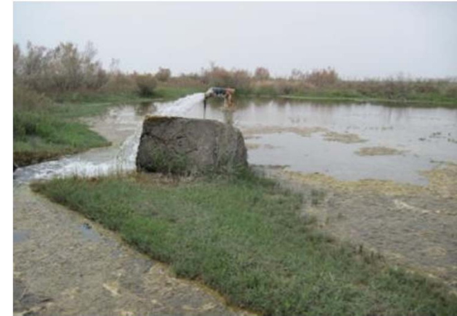
Artesian well; water for irrigation