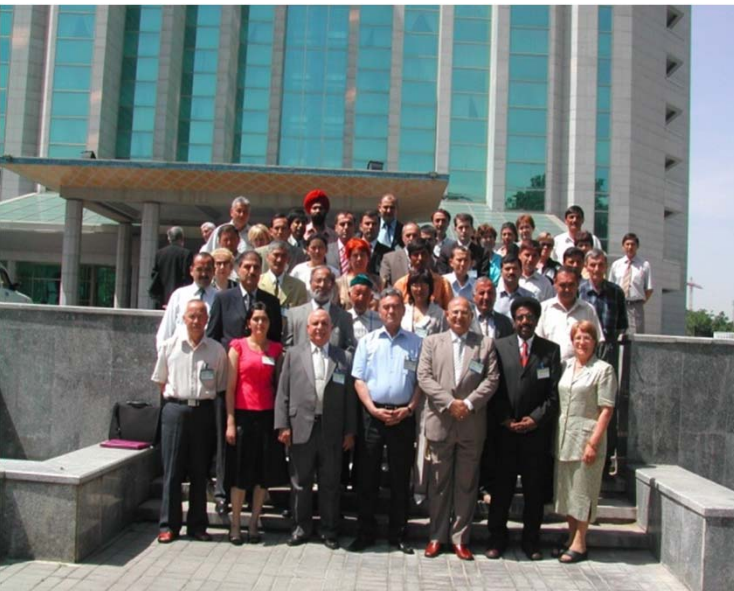
Participants of the training course May, Tashkent 2006

ICBA-CAC jointly with Uzbek Research Institute of Desert Ecology and Karakul Sheep Breeding demonstrated to farmers the achievements and publications regard utilization of halophytes and salt tolerant crops