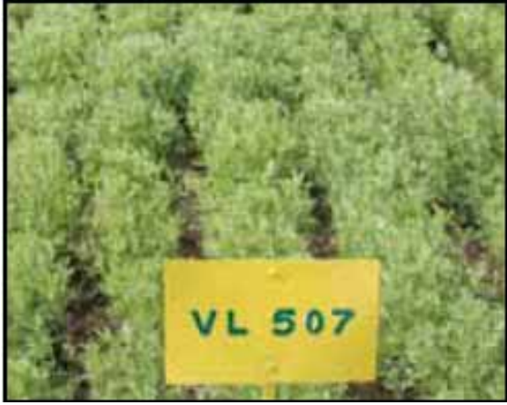
Lentil variety VL Masoor 507 in Almora, India Pakistan

The Vivekananda Parvatiya Krishi Anusandhan Sansthan in Almora, India, recently released 'VL Masoor-507' lentil variety for the North Hills Zone of the country. The variety was developed through single plant selection from an ICARDA breeding line ILL 7978. It is semi-erect, and matures in 140 days like the local varieties, but outyields them by 37%. It has a yield potential of 2.5 t/ha, and has wide adaptability, high wilt resistance and large seeds – traits that consumers like. The variety is spreading fast among farmers in hilly areas of northern India.