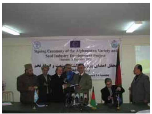
H.E Obaidullah Ramin, Minister of Agriculture and Irrigation (third from right) during the signing ceremony

The overall objective of the second phase is 'contributing to higher productivity of major staple crops in Afghanistan and to higher food security, particularly in rural areas'. The immediate objective is 'improving access of farmers to quality certified seeds and planting material of major staple crops (wheat, rice, vegetables, etc.)'. Outputs are expected in four key areas: (i) strengthening the Agricultural Research Institute of Afghanistan to effectively develop new varieties and produce breeder seed; (ii) enhancing the capacity of the Improved Seed Enterprise to produce foundation seed of newly released and popular existing varieties; (iii) establishing a National Seed Board with affiliated bodies (Variety Release Committee, Seed Certification Agency and Seed/Plant Health Inspectorate) for coordinating seed industry functions; (iv) putting in place an appropriate system for commercializing certified seed to farmers.