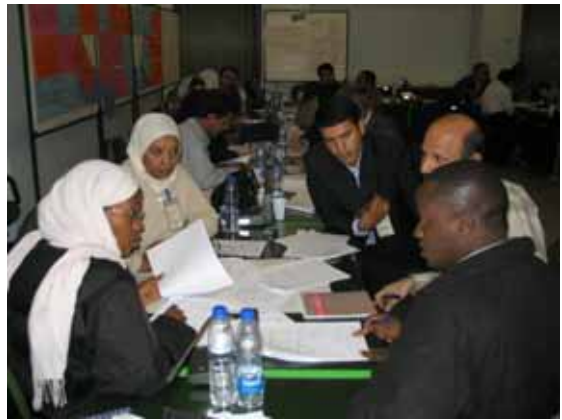
Participants during class work on participatory seed system analysis

The third module discussed the theoretical background and technical and strategic tools available for ex situ and in situ conservation programs to combat the loss of crop genetic diversity. The workshop concluded with the design of management plans for complementary conservation strategies.