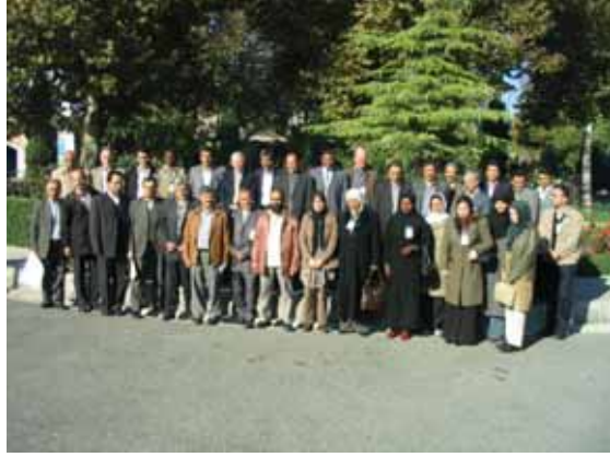
Participants of the regional training course in Karaj, Iran

The first module focused on alternative seed delivery mechanisms: establishing small-scale seed enterprises involving farmers and communities, use of decentralized seed production and marketing to improve seed supplies in less favorable or isolated areas. The workshop concluded with the design of plans to support local seed production or small-scale seed enterprise development.