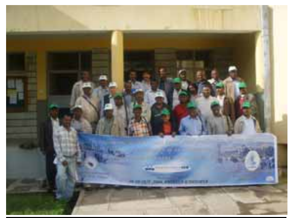
Participants of the first TMTP course in Ethiopia

regional states: Amhara, Oromia, Southern Nations, Nationalities and Peoples (SNNP) and Tigray. The participating institutions also include Regional Agricultural Research Institutes, Regional Bureaus of Agriculture and Rural Development, and NGOs implementing farmerbased seed production and marketing schemes.