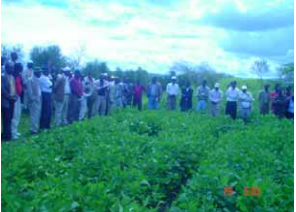
Field day on promotion of soybean seed production under the cooperative model

The Awassa Research Center, Bureau of Agriculture and Rural Development of Sidama and Gurage zones, Farmers' Cooperative Unions (Sidama ELTO and Walta), Self-help Development International Capacity Building Project (NGO) and farmers were identified as potential partners. The partners identified potato, onion, wheat, and soybean as potential crops. Activities began in 2004 in two zones (Sidama and Gurage) with the intention of improving the livelihood of smallholder farmers by enhancing productivity and market access. Because of the acute seed shortage of the selected crops, seed was multiplied by some cooperatives in order to ensure seed availability and self sustainability.