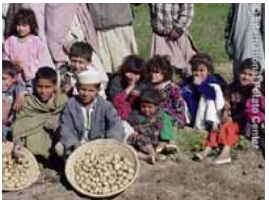
The CIP-ICARDA program aims to strengthen potato seed production in Afghanistan

Potato is the third most important food crop in Afghanistan, but good quality seed is scarce due to absence of formal sector and an ineffective informal sector limiting the potential to increase area and productivity and improve quality of the produce.