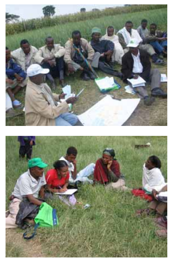
Training participants work with communities in participatory seed system analysis (top) and seed demand survey (bottom)

informal seed supply. The second component focused on farmer-based seed production and institutional support required, technical aspects of farmer-based seed production, and small-scale seed enterprise development. Both modules included field work in participatory seed system analysis and designing market-oriented local seed production and marketing enterprises.