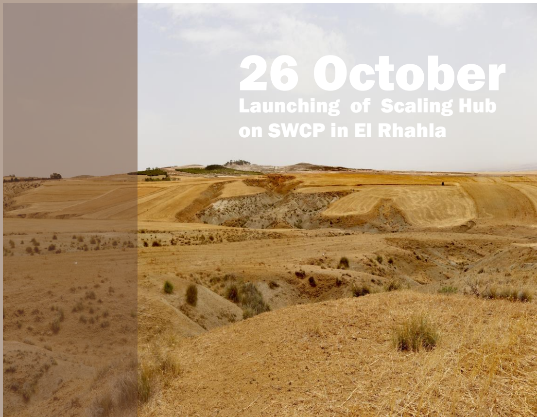
Intervention Landscape at El Rhahla Site, Gaafour – Siliana