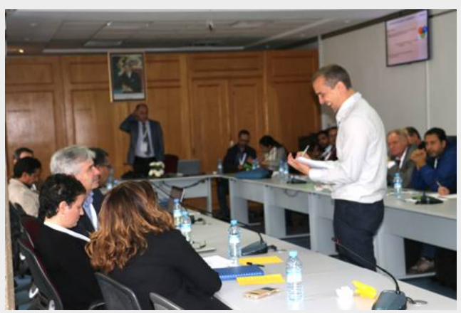
(3) Workshop Participants, November 2019

This all-day event was attended by both project stakeholders and self-funded participants, including students and scientists from international research for development organizations. The sessions featured presentations, workshops, and discussions around key thematic areas including: natural resource management, sustainable land management, conservation agriculture, livestock data, agricultural development solutions, and climate resilience.