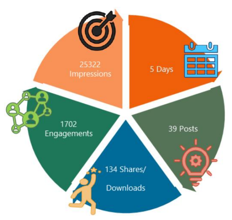
Fig. 1: Social media analysis of Virtual Learning Route-Sudan ROUND MODEL