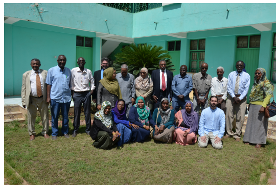
Sudan National Writeshop, 22 October 2019

The “National Writeshops to Develop Capacity Building and Innovation Plans” for Moldova, Morocco and Sudan were conducted to gather the information needed to inform the Innovation Plans, which will link their proposed solutions with the Capacity Needs Assessment (CNA). The writeshops were conducted with a participatory approach to gather inputs from the institutions and provide training. The combination of several knowledge probing methodologies effectively elicited insights on the institutions needs and improvable assets. Read the full report here .