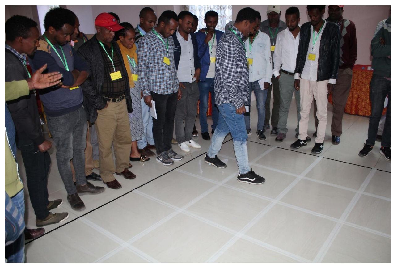
CoP training on Entrepreneurship skills and Financial literacy.