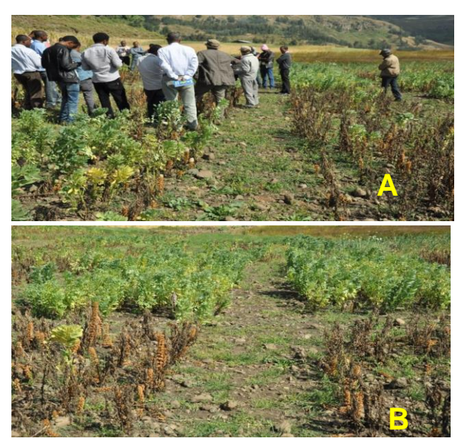
Figure 3. Plots of Demonstration on Integrated Management of O. crenata in faba bean, Kutaber District, South Wollo Zone, Ethiopia; ( from top to bottom ): [A] stakeholders visiting the demonstration site; [B] ( foreground ) faba bean severely infected and damaged by O. crenata , ( background ) faba bean slightly infected by the parasite – (improved practice: integrated parasitic weed management). (Photo courtesy: Mulugeta Alemayehu).

management. Instead, employing a range of measures in integration, to prevent crop loss due to the parasites and eradicating the parasites seed bank in soil, is the only feasible approach to successfully manage the weeds. In this respect, credible achievement has been scored by the Sirinka Agricultural Research Center. The management of O. crenata in faba bean through integration of recommended control methods: employing host plant resistance (faba bean cv Hashengie), two applications of reduced rate of glyphosate (144 g ha<sup>-1</sup>) and hand weeding before the parasitic weed have been demonstrated flowers (Negussie et al., 2015; Figure 3).