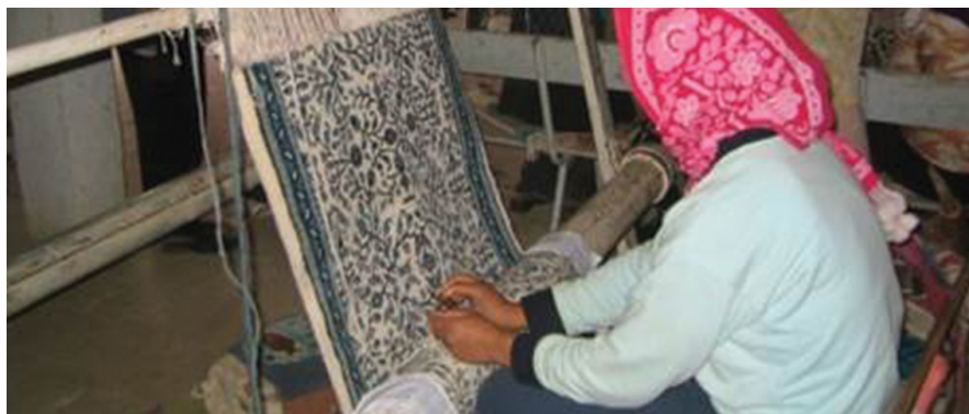
Small-scale handicraft businesses were started in Tunisia's Kasserine and Medinin Governorates.

Financed by the World Bank and initiated by the Ministry of Agriculture, this program provides training which targets marginalized individuals - women and young graduates – and equips them with the skills and knowledge to set-up and maintain small-scale enterprises. Assistance is on-going for one-year, enabling individuals to consult project leaders and seek advice on a range of issues. of fruit from their trees.