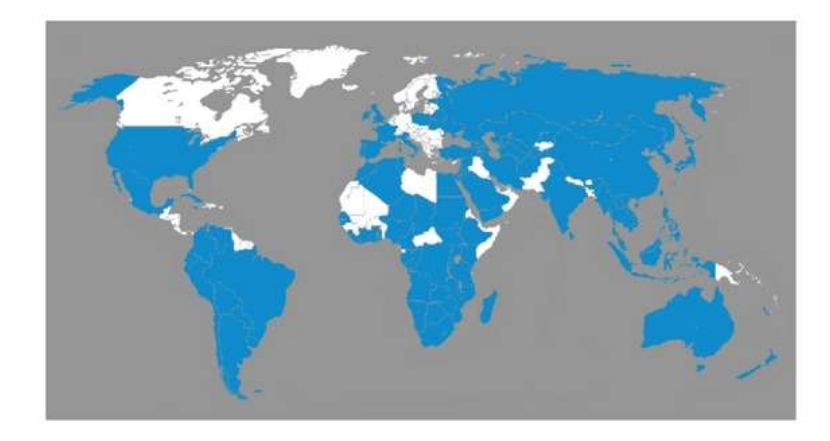
Figure 1 : Global distribution of fasciolosis (Nyindo & Lukambagire, 2015)

The phenotypic and genetic resistance of local sheep breeds to fasciolosis in Tunisia has never been investigated. Therefore, the aim of the present work is to study the phenotypic variability of local sheep breeds to fasciolosis to identify and characterize resistant animals. Indeed, phenotypic measurements have been collected in the following area.