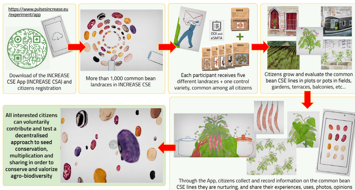
Figure 3. INCREASE citizen science experiment (CSE, illustration by Daniele Catalli). Registered CSE participants, using the expressly developed and constantly updated INCREASE CSE app, will be involved in the conservation, evaluation and valorization of the common bean genetic resources and will test the INCREASE decentralized approach to genetic resource conservation, sharing and valorization.

Moreover, within INCREASE, a citizen science experiment on common bean has recently been launched (Irwin, 2018; van Etten et al., 2019; Würschum et al., 2019; www.pulsesincrease.eu/experiment ; Figure 3): external participants, throughout the registration and the use of a dedicated app (Increase CSA, Ubisive srl, from the Google Play Store or the App Store), can exploit a subset of genotypes from R-CORE (about 1000 genetically purified accessions that have been genotyped within the project BEAN_ADAPT; ERA-CAPS 2° call, 2014) to contribute to