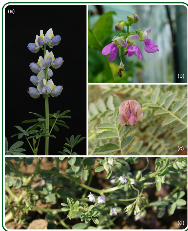
Figure 1. Flowers of the four INCREASE legume species. (a) Lupin ( Lupinus mutabilis Sweet). (b) Common bean ( Phaseolus vulgaris L.). (c) Chickpea ( Cicer arietinum L.). (d) Lentil ( Lens culinaris Medik.).

heterogeneous, which impedes the projection of the phenotypic information to the genotype and vice versa ; moreover, if available, single-nucleotide polymorphism data are mapped to a single reference genome, which exclude variants present only in a subset of accessions, without the possibility to access structural variations and to obtain a complete picture of the functional genetic variation (Richard et al., 2021);