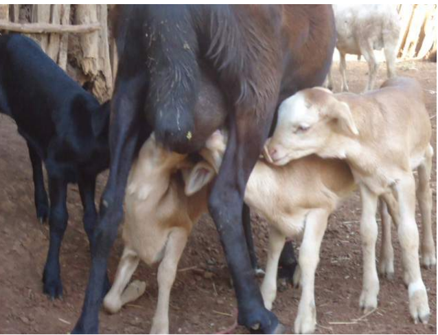
Bonga sheep suckling its quadruplets

Progesterone concentrations in peripheral plasma of Menz ewes were monitored weekly during gestation using ELISA assays. Mean hormone concentrations were basal, \leq 1.0 ng/ ml at service, but increased to 4.7 ng/ml on day 14 and remained elevated throughout pregnancy. The concentrations differed significantly between ewes and stage of gestation, but not due to number or sex of fetuses. Progesterone production was also not related to weight of lambs at birth (r = 0.24).