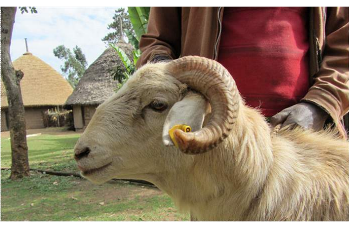
Ram of the Doyogena breed

trus. Hormone concentration rose steadily to peak at 5.0-5.6 ng/ml on days 10 to 14 (peak luteal phase). This was followed by a rapid decline to 3.0 ng/ml on day 15, 0.8 ng/ml on day 16, and 0.2 ng/ml on the day before estrus (regression of the corpus luteum). It is concluded that the ELISA method can be used to assess progesterone levels in Ethiopian sheep with accuracy. Also, progesterone levels in plasma of under 1.0 ng/ml are indicative of either anoestrus or the follicular and early luteal phases of the estrus cycle (Mukasa-Mugarwa et al., 1990).