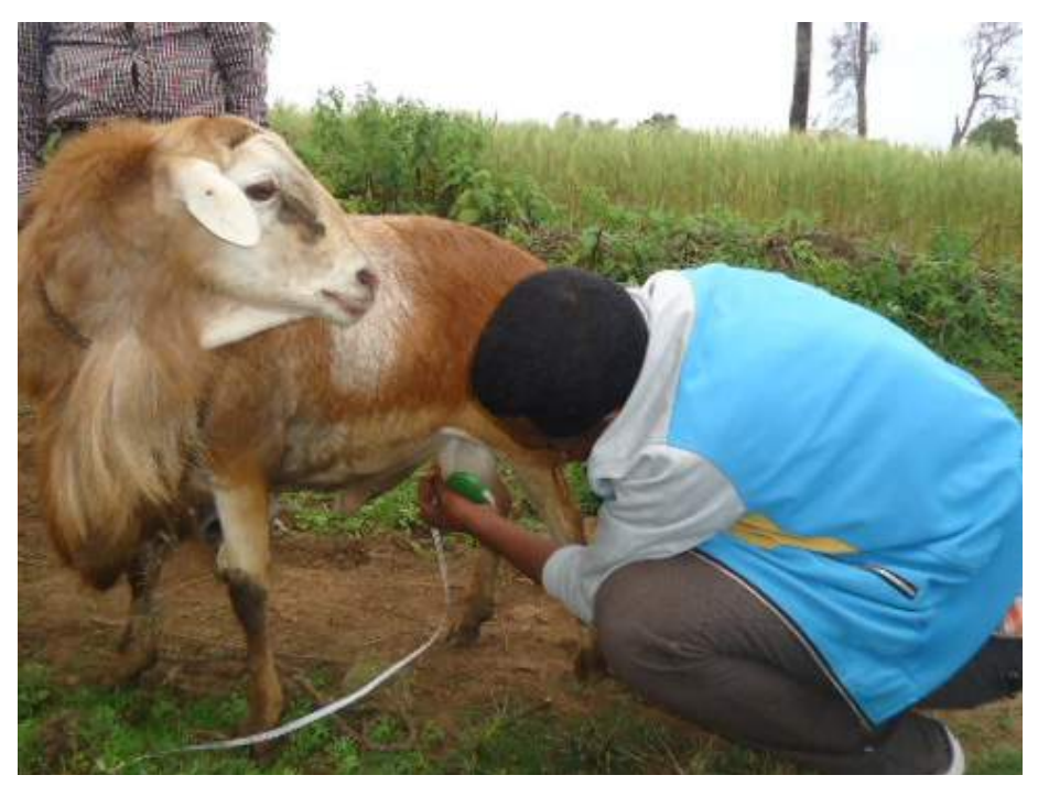
NARS researcher assessing a ram's external reproductive organs

Additionally, Menz rams presented a better soundness (libido and fertility) than Horro males and this was reflected in a higher conception rate at first and second estrus (80 and 18 percent, respectively) (ILCA, 1994).