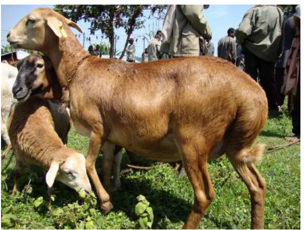
Selected Bonga ewes in the community based breeding program

In the traditional management system – where most animals are raised – further studies are required on better nutrition and control of diseases (endoparasitism) in young animals to increase reproductive efficiency, flock productivity, and number of animals for finishing and slaughter (Mukasa-Mugerwa and Lahlou-Kassi, 1995).