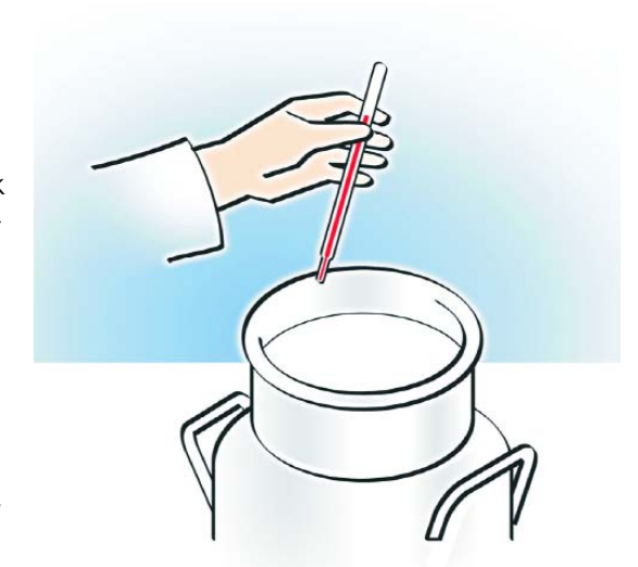
Measuring milk temperature

Here, we describe four simple quality control tests. These tests will meet the requirements of most farmer cooperatives, collection centers and small-scale processing units. If the tests are done properly and consistently, it will ensure that poor quality milk is rejected, and only good quality milk is sold to processing factories, milk bars and shops.