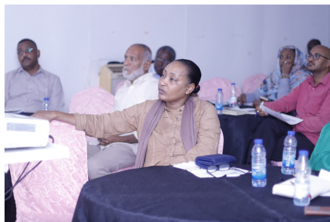
(4) Citizen Science Symposium Part1, November 2 2019

Starting in November, the Sudanese Knowledge Society launched a series of “ Citizen Science ” symposiums. According to one of the symposium co-organizers, the goal of the initiative is to facilitate “the democratization of science, presenting an opportunity for all sections of society to contribute to, and benefit from, the knowledge of science.”