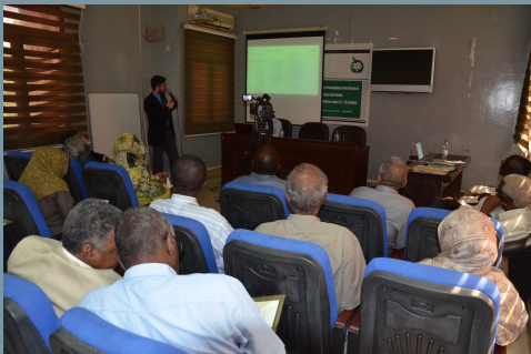
(1) Sudan Writeshop, 22 October 2019

Three regional writeshops were organized in project target countries to develop innovation plans for improved knowledge management (KM) frameworks tailored to the needs of participating institutions.