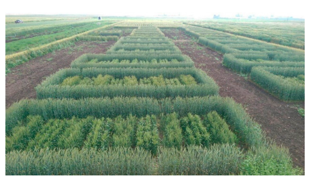
Figure 3. Experimental design to test the efficiency of the CHA used and female seed set.