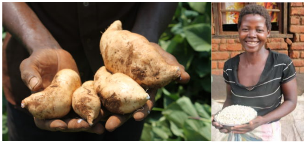
Three 'Chipika 'roots or seven Kadyabuwere' roots were traded for a heaping bowl of maize.