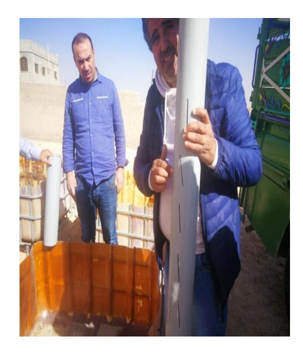
3- Add gravel on the pipe and covering the pipe to save and absorb water