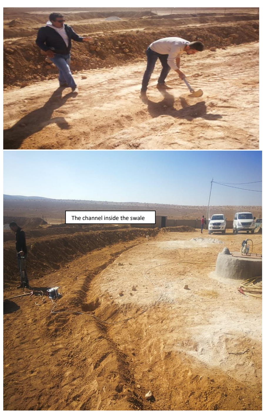
4) Digging holes inside the Canal that was previously designed to plant trees