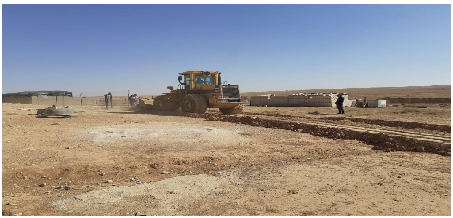
2- Digging the interior part of the Swale and put the soil resulted up the lower end of the Swale