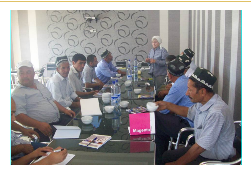
Fig. 11. Round table discussion with farmers in Fergana.