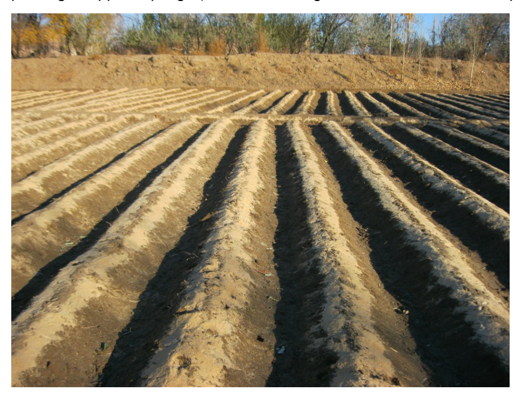
Fig. 8 Mulching of apple seeds planted in rootstock nursery of farmer Mr. Bayramdurdi Satlikov (A. Durdiev village, Turtkul District, Karakalpakstan)