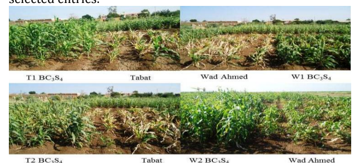
Fig 1. Phenotypic evaluation of BC3S4lineswiththe parent in artificially Striga infested plot.

Characterization of BC<sub>4</sub>F<sub>1</sub> populations: The selected BC3F4 lines were backcrossed to the recurrent parents to generate BC4F1 progenies. High quality DNA of 145 progenies was extracted and normalized to 5 \text{ng}/\mu \text{l} . Twenty six polymorphic SSR markers were optimized. BC4F1 lines (145) along with the parents (3) were screened with 26 SSRs; data revealed that all QTLs (5) were introgressed. QTLs (25) were introgressed in only 15 progenies (Fig. 2).