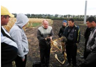
Alternative practices for sustainab...