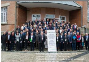
"Towards Sustainable Agriculture ...