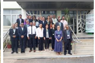
First Step on a Four Years Route to...