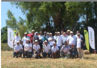
Opportunities for Crop-Livestock In...