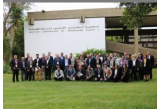
What is Knowledge Management?