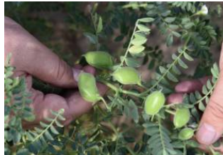
Chickpea: an alternative crop for r...