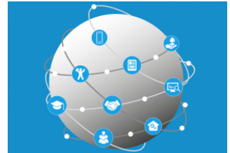
A Step-wise Approach to Assessing K...