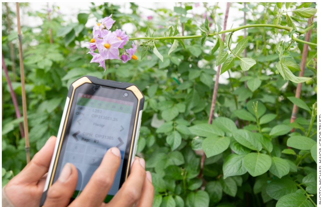
Photo 2. A technician records flowering scores of potato-breeding lines using Fieldbook application on a smartphone.

To increase operational excellence, standard operating procedures for breeding data management were developed for sweetpotato and compiled in a document ( https://cgspace.cgiar.org/handle/10568/109605 ). These procedures were established in the framework of the SweetGAINS project, and their implementation was later extended to all CIP sweetpotato-breeding programs. Compliance with the procedures ensures the use of naming conventions, general data curation rules, measurement protocols, official trait ontology, and fixed data workflows (for phenotyping, crossing experiments, laboratory analyses, germplasm inventory, and genotyping project management) based on digital data recording tools and the relational database SweetpotatoBase ( https://sweetpotatobase.org/ ). Guidelines about the use of modern statistical experimental designs for field experiments, depending on the breeding stage, are also included in the document. The transition of full compliance to the standard operating procedures began in 2020 and should be completed in 2021 for all CIP's sweetpotato-breeding programs. A similar initiative was taken for the potato-breeding programs, but these procedures are still under development. All these efforts are made to increase the quality of a very valuable good in a breeding program, namely the data on which breeding decisions are finally based.