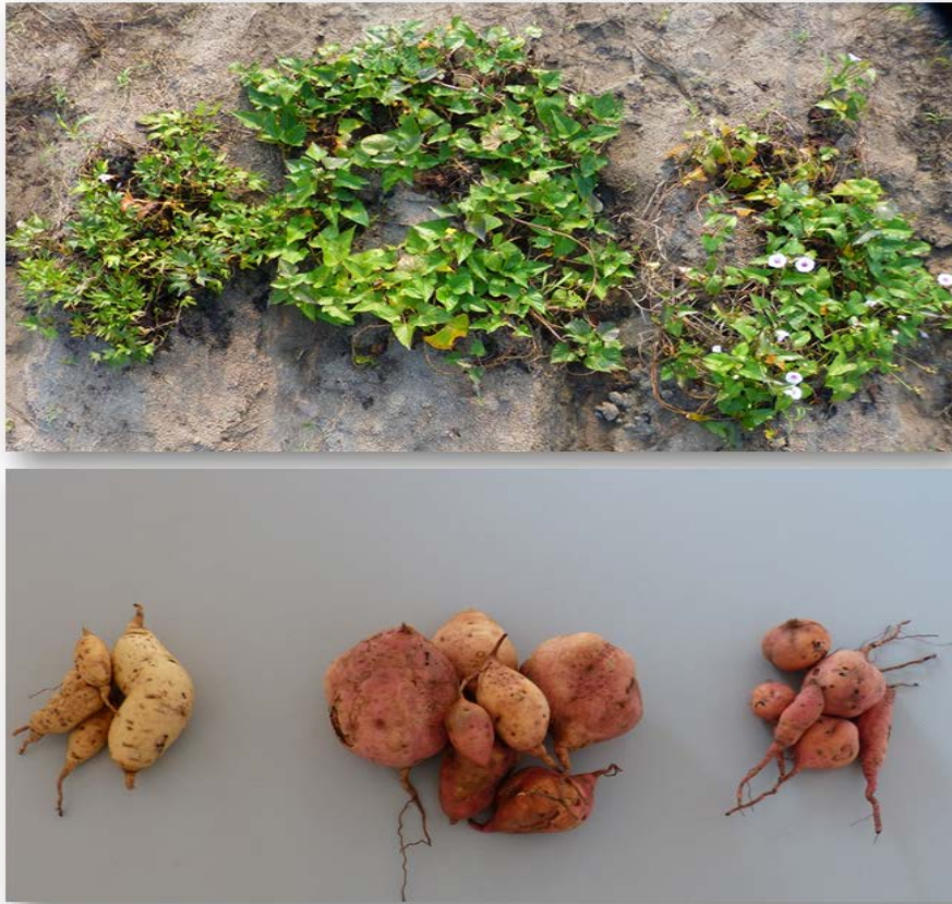
Photo 3. Hybrid sweetpotato genotype flanked by its progenitors.

The hybrid sweetpotato innovation proves that heterosis can be successfully exploited to achieve a step-change in the rate of improvement of root, tuber, and banana clonal crops. These offer highly nutritious and biofortified dietary options that can be grown in a diverse range of environments, even under climate change. Because of its short crop cycle, as well as the insights and failures gathered from this experience, sweetpotato could become a model clonal crop whereby heterosis-related hypotheses could be tested before their implementation in other clonal crops.