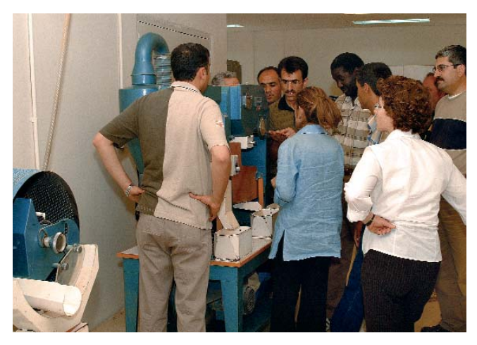
A training session on seed processing for GAP staff.

Capacity development is an essential component of the GAP/ICARDA collaborative project. The on-farm demonstrations and testing of materials has enhanced the capacity of researchers, extension workers, farmers, and the private sector in the region. Training courses were held in Turkey and at ICARDA headquarters for the project participants. The courses focused on cereal and legume breeding methods; variety management and seed quality assurance; seed production, processing, storage, and marketing; and water management. There were also courses on the use of taxonomic keys of forage legumes, on-farm livestock methodologies, data collection, management, and analysis; strategic livestock feeding; and improvement of milk yields.