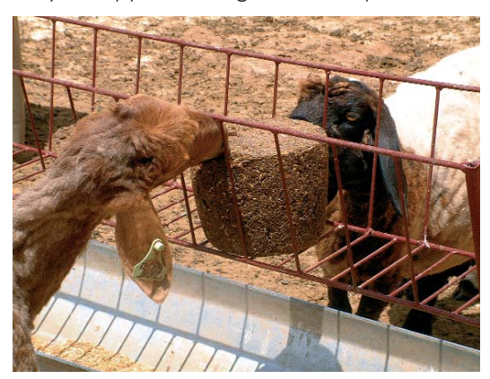
Feed blocks now provide supplementery feed sources for sheep in the GAP region.

The feed blocks technology is simple, cheap, and does not require sophisticated equipment. Feed blocks were manufactured with locally available agricultural byproducts, thus promoting their utilization in feeding systems. The technology has proved to be one of the most efficient methods of using urea as a source of nitrogen and a strategic way of supplementing feed to improve small ruminant performance.