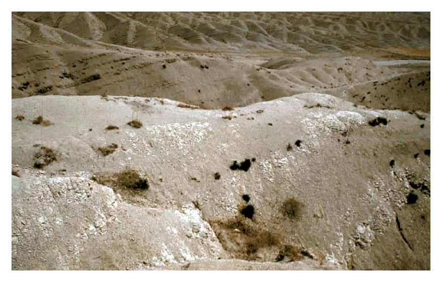
About 25% of the total land area in southeastern Anatolia is at risk of water and wind erosion.

Proper management of natural resources requires a proper qualitative and quantitative inventory of the socio-economy, vegetation, and soil, including current land use. In June 2000, GAP and ICARDA agreed to monitor rangeland and biodiversity in a pilot project in Kuyulu. The objectives were to provide information to support future land improvement and rangeland management, establish a reference vegetation map to monitor land use changes, document current land use and carrying capacity, and assist in erosion control.