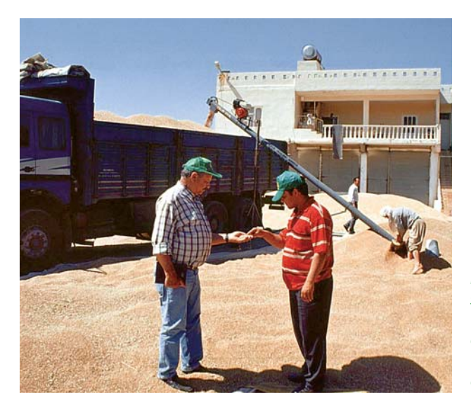
Wheat yields have increased significantly in the GAP region as a result of the on-farm demonstrations.