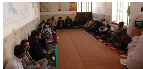
Undertaking participatory mapping