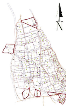
Maps and overlaps