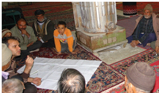
Undertaking participatory mapping

The project is located in total area of 32 hectares that belong to about 70 farmers. Land tenure in this village is very low (less than 0.5 ha/farmer), and therefore careful planning of land, water and other resources is needed. The project consists of using participatory mapping approach to work out with farmers the location and size of their parcels. Based on maps, problems and main constraints as identified individually and collectively were overlap in order to visualize common issues and priority to undertake in both private and communal actions.