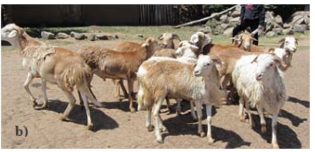
Figure 1. Typical Doyogena sheep with light red coat colour type and plain pattern. (a) Ewe with her twins, (b) Castrated sheep selected for fattening and marketing.