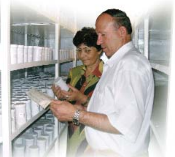
Genebank at the Research Institute of Crop Husbandry, Tajikistan.

With support from the Global Crop Diversity Trust (GCDT), a regional meeting on development of CAC PGR Strategy was held on 28-29 August 2004, in Tashkent, Uzbekistan. Twenty-two participants, including those from all eight CAC countries, and representatives from IPGRI, ICARDA, and GCDT attended. As a follow up to this meeting, GCDT has recently funded new PGR projects in plant genetic resources, in collaboration with ICARDA, IPGRI, and VIR, S. Petersburg.