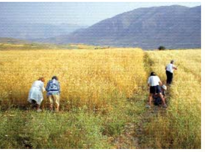
A collection mission in CAC.

ACIAR-funded project, "Development and Conservation of Plant Genetic Resources from the Central Asian and Caucasian Countries," is