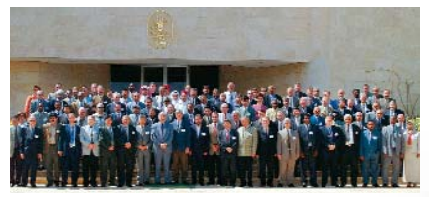
Researchers and research administrators from throughout CWANA met at ICARDA headquarters to integrate regional agricultural research priorities into the CGIAR agenda.

opportunities for agricultural research and development in the CAC region, the following research priorities were identified for CAC: