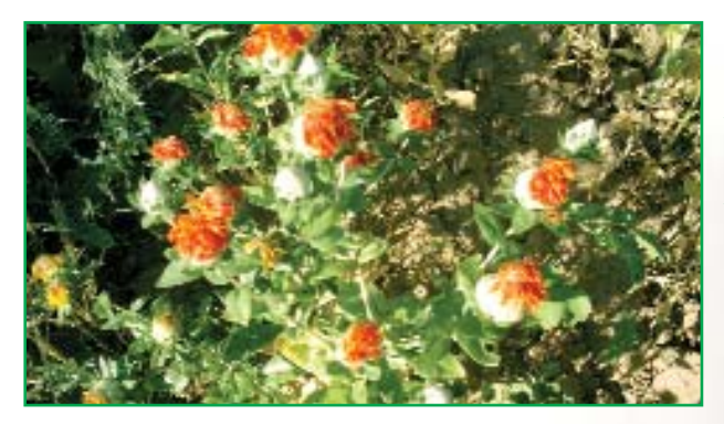
In drylands of southern Kazakhstan and Kyrgyzstan, safflower was found to be the most reliable crop for diversification under small farm conditions.

Adoption of sunflower as an oilseed crop has been quite successful. Its area in northern Kazakhstan has increased by 50,000 hectares in the last three years. The major reason for this is the demand in the domestic market for edible oil, which is otherwise imported. Sunflower seeds are also being processed on farms and sold. Safflower is another new crop, which was never before sown in the north but now covers several hundred hectares. Among food legumes, field pea is now grown on about 5000 ha, and chickpea on 2000 hectares. Buckwheat area is also increasing but is still smaller than during the Soviet Union times when the government procured entire crop produce.