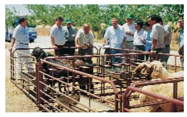
Central Asian farmers and scientists visiting the Sheep Unit at ICARDA's headquarters in Aleppo, Syria.

A participatory approach was used to study conflicts and complementarities among different production systems. In countries with more intense reforms such as Kazakhstan and Kyrgyzstan, the balance still