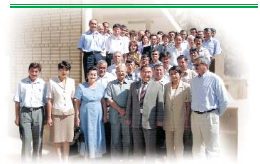
Second national workshop on "Strengthening the wheat program in Uzbekistan," held on 12 September 2003, Tashkent.