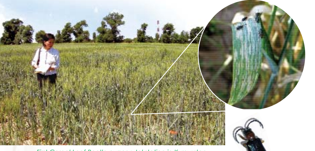
First Cereal Leaf Beetle nursery: Jal station in Kyrgyzstan.

A regional training course on integrated pest management was organized in Tashkent, Uzbekistan on 18-23 May 2004, and was attended by 22 participants from seven countries.