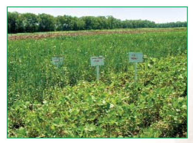
Mungbean and soybean are promising for double cropping in Tajikistan and Uzbekistan.

varieties of both wheat and cotton are used. Wheat planted in standing cotton using minimum tillage proved to be the best option. In southern Uzbekistan and Tajikistan, cotton is grown after winter wheat on 20,000-30,000 hectares in each country.