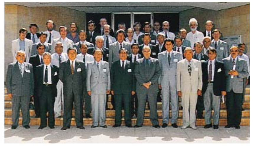
The first ICARDA/CAC coordination meeting was held at ICARDA headquarters in Aleppo, Syria, in September 1997.

At the first ICARDA/CAC coordination meeting in September 1997, senior scientists and research managers from five CAC countries developed a number of joint research project proposals in priority areas. Such meetings have been very effective in strengthening the collaboration between ICARDA and the national programs. The CGIAR program is managed by a steering committee that meets annually to assess progress and promote future collaboration.