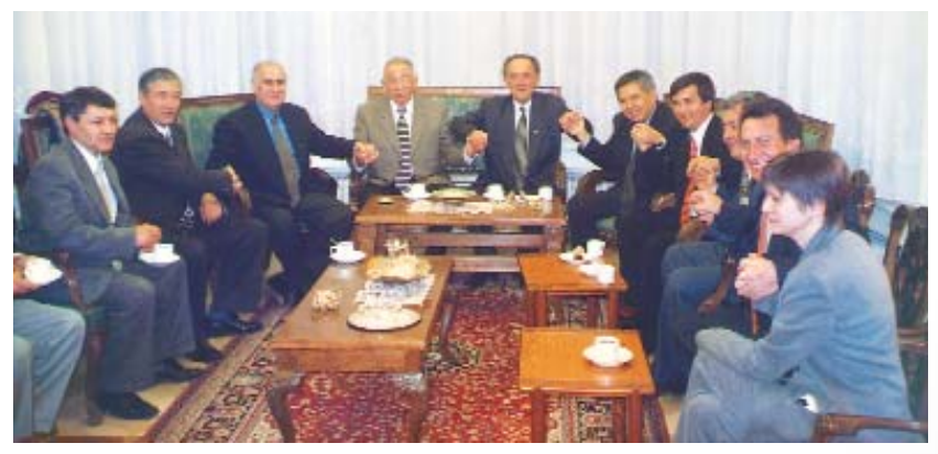
Heads of CAC NARS are working as a team to solve common problems at the regional level.

genebanks in Azerbaijan, Georgia, Kyrgyzstan, Tajikistan, and Uzbekistan have also been modernized for improved efficiency and better storage facilities. Efforts are underway to support the establishment of a genebank in Turkmenistan.