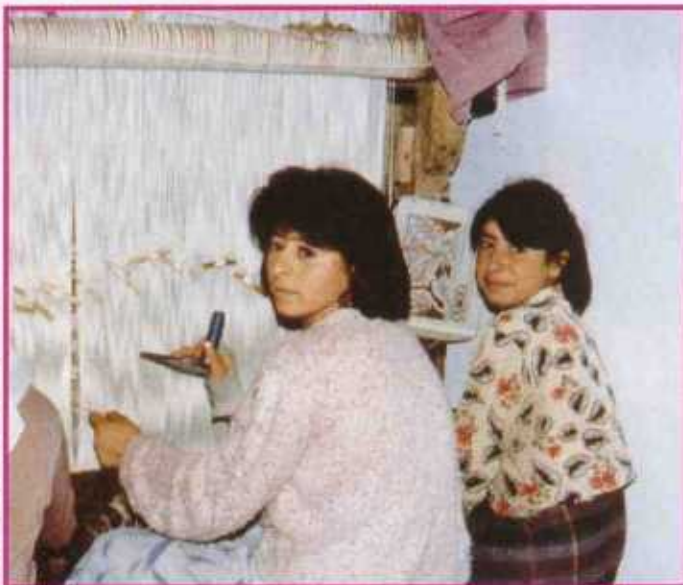
Weaving—an important local industry

Does this mean that there is a balance that will enable subsistence and commercial farming to co-exist in the area? Well, maybe—if the cash income is enough. It may not be. This is not lucrative work.