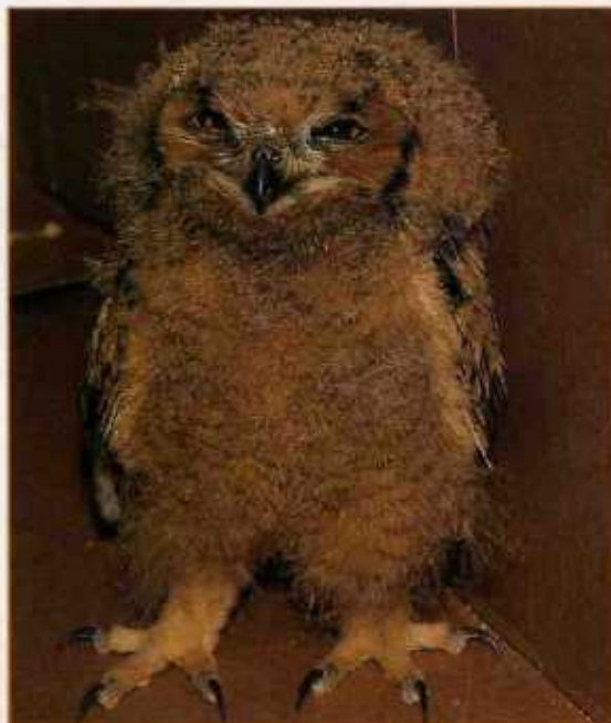
Not one of ours! This long-eared owl dropped by at ICARDA and was cared for by staff. The owls living on the farm are little owls. Sadly, the visitor did not live long