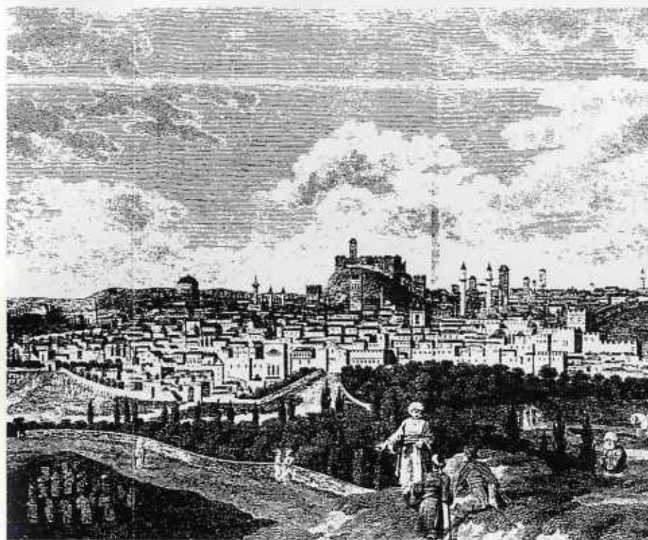
Aleppo in the 1750s: an important crossroads between East and West

kidney bean, and India millet...The horses are fed universally with barley; but Lucern is also cultivated for their use, in the spring."