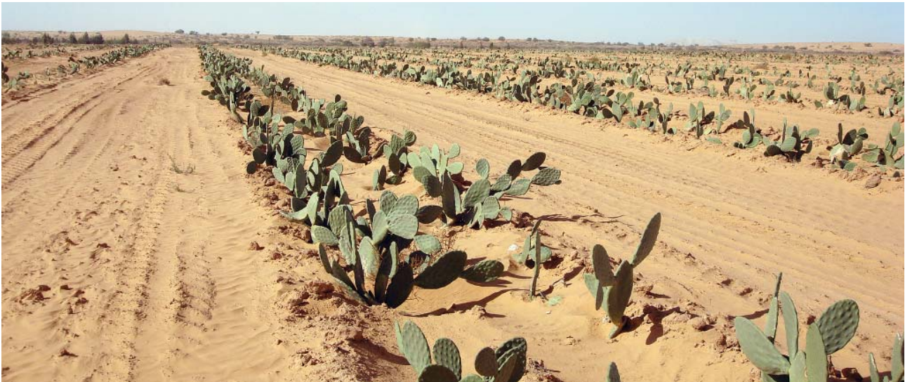
Spineless cactus provides multiple benefits – livestock fodder, erosion control, soil nutrients, re-greening degraded areas.

were identified for each zone. Despite the challenges, both countries have enormous potential to increase food production: yields can be increased by at least 46% in every ecological zone – and up to five-fold in some areas – using currently available technologies. National policy makers plan to use the poverty maps to focus on the most vulnerable areas.