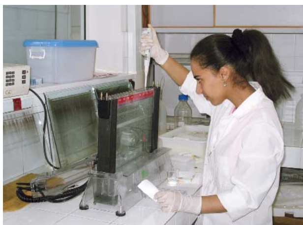
ICARDA training programs have helped create or expand biotechnology research in several African countries.

ICARDA and its partners have helped build R&D capacity in countries across Africa. For young researchers we offer training courses, internships and support for graduate study. For extension staff and