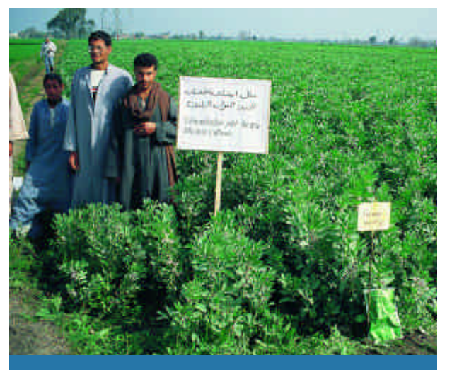
Improved faba bean technologies have helped improve food security and incomes for smallholder farm households.

Has the project made a difference? To find out, ICARDA and national research centers in each country jointly conducted a series of studies aiming to: