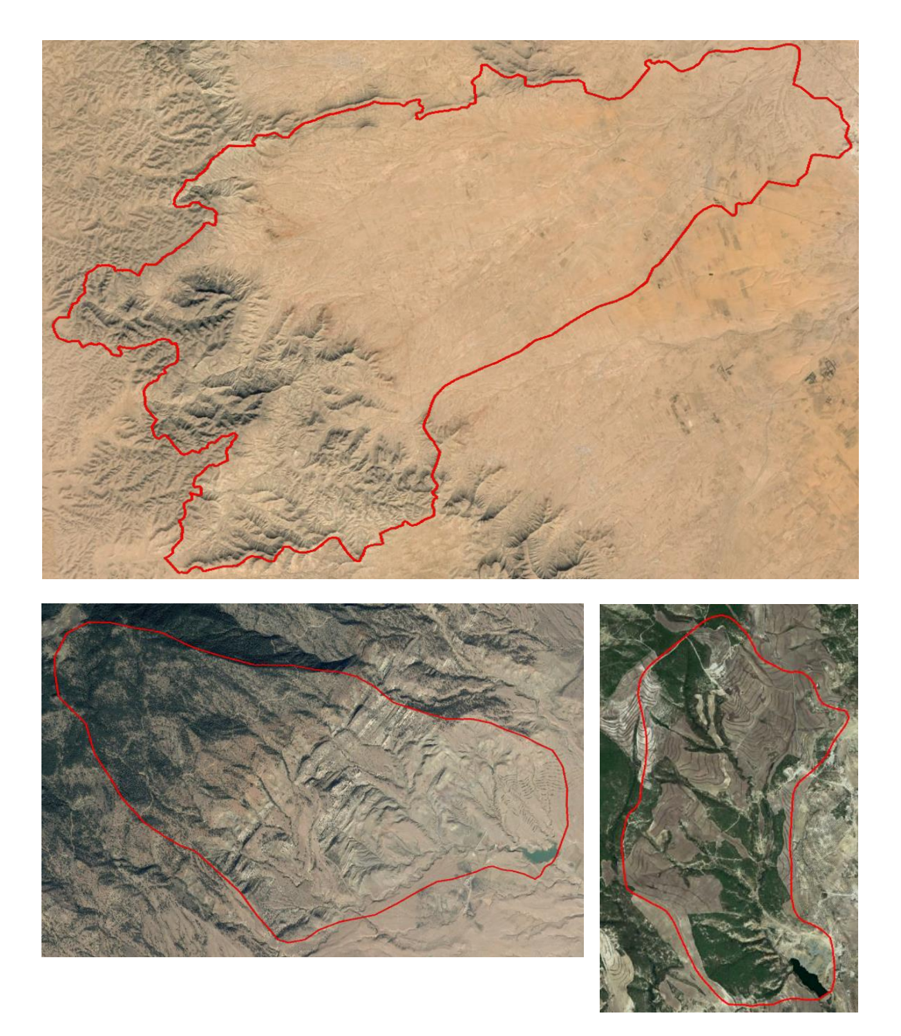
Figure 2. The three experimental watersheds as they appear in satellite images. Images are not in the same scale and not the same date.

Among the SWC structures considered in the study sites, the terraces or contour benches, the hill lakes, and the jessour are the main ones. These are among the most widespread and relevant SWC techniques in the Tunisian CRP-DS study sites (Béni Khedache-Sidi Bouzid transect). Their main characteristics and functions are summarized below.