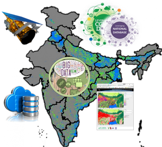
Spatial big-data analytics in india.

Another example of geoinformatics' impact on agriculture is presented by the recent advances of the NASA's mission mapping soil moisture, that recently provided crucial information to track the base level of residual moisture. This data can now contribute to inform better decisions, targeting landscapes with crops featuring higher return on investment, adaptability, and fit with the local irrigation assets.