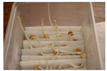
Picture 1. Five day old plumules of seed germinated on folded filter paper at 22°C.

where: P = confidence interval (often 0.95, for a 95% confidence interval);