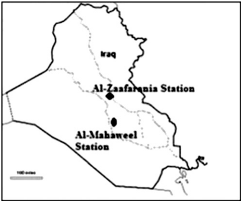
Fig. 1. Sample collection sites of date palm in Iraq.

MICROSATELLITE AMPLIFICATION. A total of 33 date palm-specific primer pairs were tested; 16 of them were developed by Billotte et al. (2004) and 17 were developed by Akkak et al. (2009) as indicated in Table 2. PCR was performed in a total