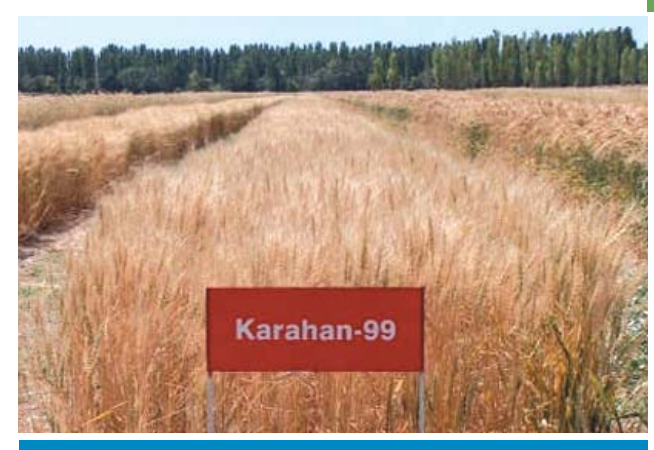
On-farm trial plots - five new wheat varieties were monitored for their adoption potential.

While the yield potential and profitability of the new varieties over the old ones was clearly demonstrated through the survey results, their degree of adoption was low. The five new varieties were grown on an aggregate 15 % of the total wheat growing area –