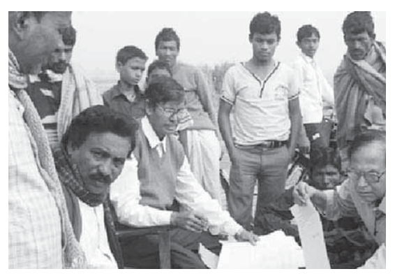
Improving seed availability: Indian farmers registering for seed certification through the sale of seeds

These centers of seed production will facilitate better access to improved seeds, speed-up dissemination rates, and broaden the appeal and adoption of pulse technologies. Farmers will also be able to generate additional income