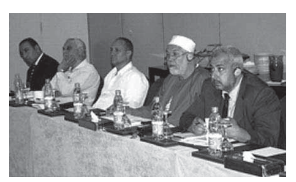
Partial view of participants of the biosafety workshop, Egypt

The participants stressed the importance of adopting a legal system that would regulate the use and handling of GM products. The participants agreed that adopting GM crops would contribute to food security in the face of population increase and the negative effects of climate change. Presentations emphasized the importance of adopting GM technology and its role in tackling the challenges of food security and reducing the use of pesticides and fertilizers in Egypt. It was also reported that many GM crops are now in the pipeline awaiting the 'green light' for commercialization.