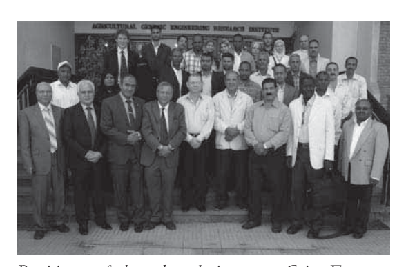
Participants of the seed marketing course, Cairo, Egypt

Sixteen participants (18.8% women) from four countries, namely; Yemen (5), Palestine (2), Pakistan (3), and Ethiopia (6) attended the course. The course was funded through the Rainfed Agriculture and Livestock Project supported by the World Bank in Yemen; the Wheat Productivity Enhancement Program supported by the United States Agency for International Development (USAID) in Pakistan; the Rapid Deployment of Rust Resistant Varieties project supported by USAID in Ethiopia; and the Development of Community-Based Informal Seed Production Enterprises supported by the Dutch Government in the Palestine National Authority.