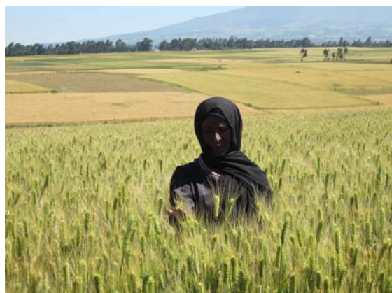
On-farm seed multiplication supported by the USAID project – an outstanding wheat crop: Top (North Shoa) and bottom (Arsi) zones

In addition, the project distributed seed of rust resistant wheat varieties through technology out-scaling activities directly benefitting over 18600 household members.