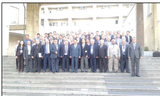
Participants of policy formulation and harmonization of legislation workshop

Specialists responsible for the formulation of seed policy and harmonization of seed legislation from ECO member countries attended the workshop. About 100 participants, including representatives from government ministries from Afghanistan, Azerbaijan, Kyrgyzstan, Kazakhstan, Tajikistan, Turkey, and