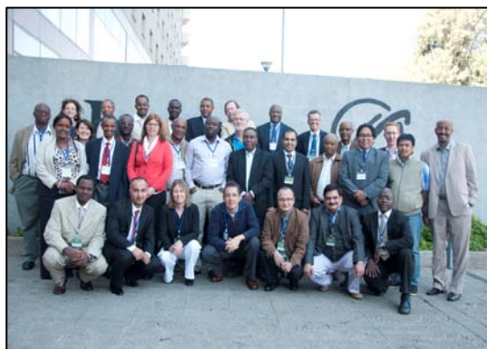
Participants of community seed production workshop

The objective of the workshop was to obtain a better understanding of CSP practices worldwide by exchanging experiences from different regions; and developing a roadmap and strategies for enhancing the uptake and effective implementation of CSP in developing countries. This would contribute to improved and sustainable crop production, food security, and livelihoods, especially in rural farming communities. The workshop explored the scope, opportunities, and challenges in CSP and identified the critical points necessary for effective implementation.