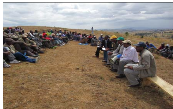
Field day organized in Gimbichu Woreda: Women's Seed Producers Group (top) and stakeholders' discussion after the field day (bottom)