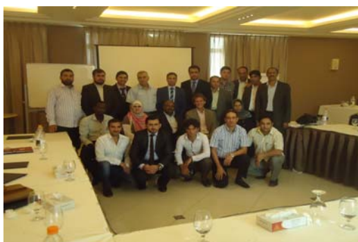
Participants of the seed enterprise development and management course

The topics of the second week focused on seed marketing – market research, seed product portfolio analysis, strategies to be followed for seed pricing, distribution and promotion, market margins, and profitability analysis of a seed enterprise. The practical exercises included estimating processing and storage costs, and the profitability analysis of a seed enterprise.