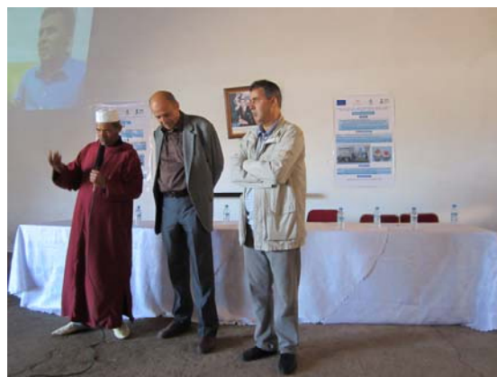
A member of the Al Hilal Al Widad Cooperative (left) giving his views on local seed business under EU-IFAD project

The two projects will support a maximum of one pilot VBSE in each of five project target sites. Each VBSE member will produce seed of a given crop based on his/her comparative