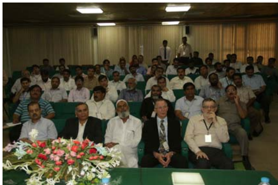
Participants of the international seed workshop

the private sector – Crop Life Pakistan, ICI Pakistan, Emky Seeds, Sohni Dharti Seeds, Rachna Seeds, and Auriga Group of Companies – supported the workshop.