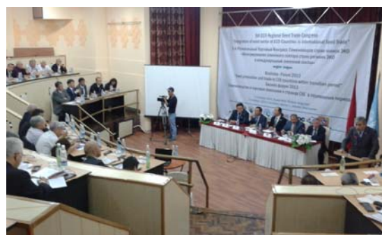
Participants of ECO Seed Congress and Business Forum

The representatives of Kyrgyzstan, Turkish Seed Union (TURKTOB), and the FAO made significant contributions in organizing the congress.