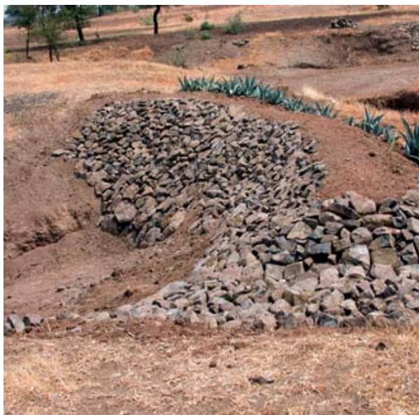
Low-cost water harvesting at Kothapally, Telangana, India

Researchers and development agencies in India have adopted rainwater harvesting and soil conservation inter-