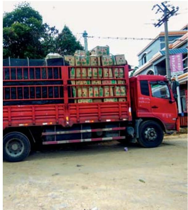
Grading and packing of green chilli and vegetables, which are then loaded onto a lorry for transport in Lucheba watershed, China

32-673 per cent. 10 Substantial increases in the area under high-value crops (40 hectares in 2003 and 113 hectares in 2005) were observed.