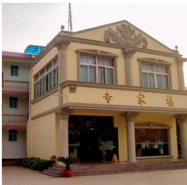
A concrete house and internet training facility at Luchebe watershed, China