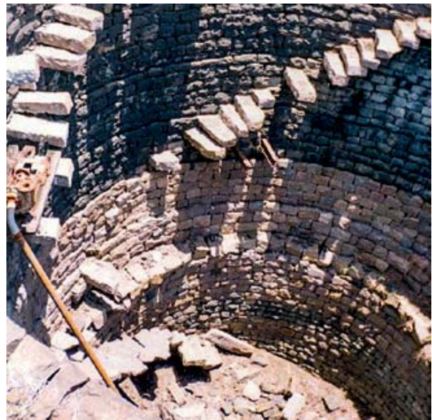
Open wells in Kothapally before watershed scenario and after, with recharge pits