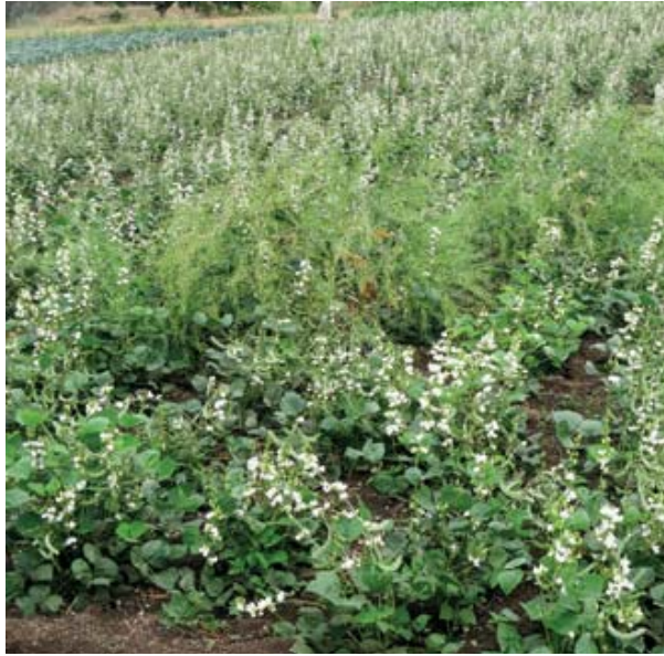
Vegetable cultivation in Kothapally, India