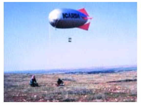
In a cooperative project between ICARDA and Japan, a video-monitoring camera takes photographs from a balloon 200 meters above ground in Syria. Vegetation maps developed from the photogrpahs are verified against LANDSAT satellite images to determine species distribution and the changes caused by overgrazing.

The contribution of Dr Haruhiro Fujita of JIRCAS to ICARDA's GIS work was particularly important. Dr Fujita was involved in a collaborative project between ICARDA and JIRCAS that collected