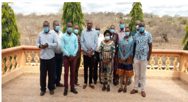
Participants pose for a photo during development of TT potato strategy on 25 th June 2021