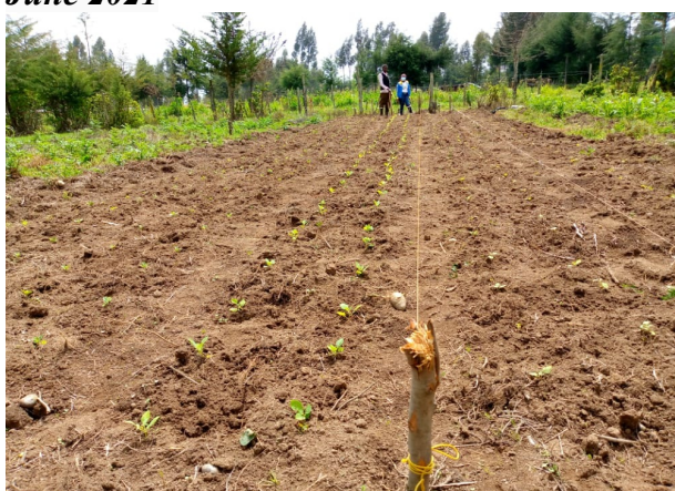
Planting of Apical Cuttings for the demos in Kinangop demo site