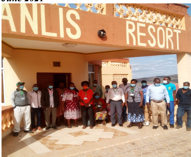
Participants pose for a photo during the training on Viazi Siazzi soko platform on 17 th June 2021