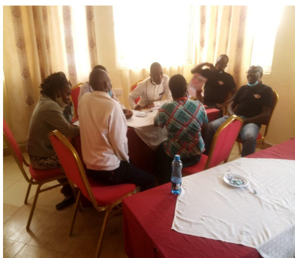
B2B discussion between FPOs and Sereni fries on 18 th June 2021