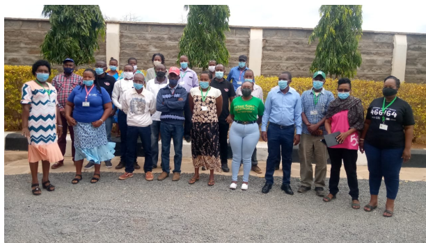
Participants pose for a photo after during the marketing forum on 18 th June 2021