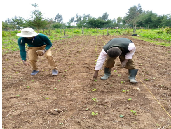
Fertilizer application on the cuttings after 1 week of planting