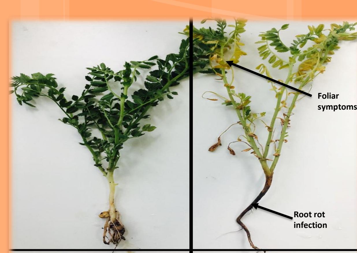
Figure 2: A: Healthy plant, B: affected plant by affected by WRR