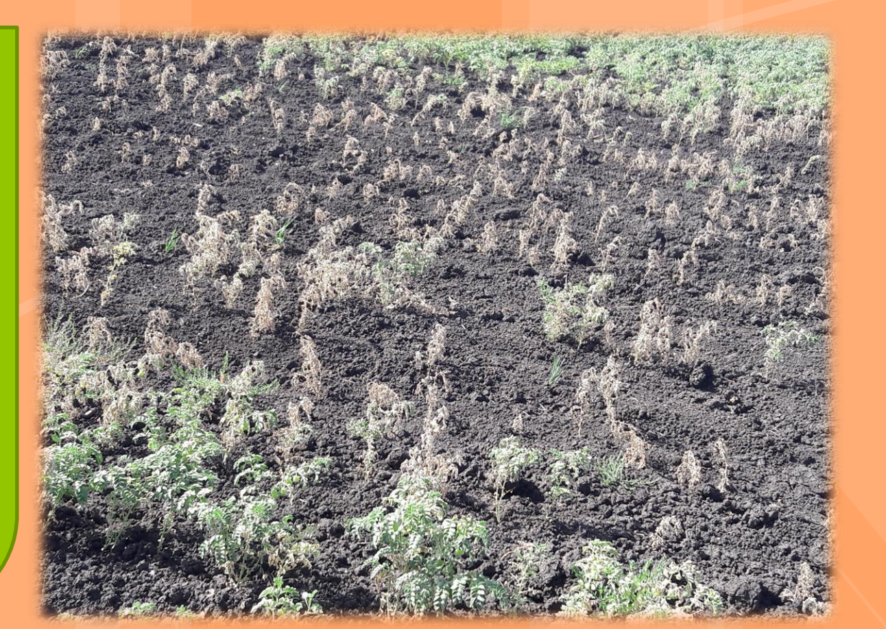
Figure 1: Chickpea field severely affected by