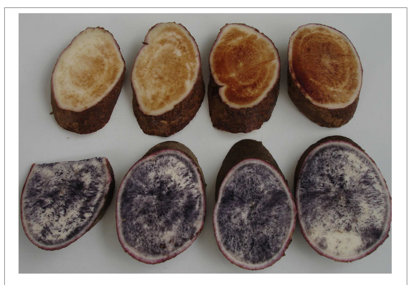
FIGURE 2 | Illustration of the staining technique based on an iodine solution used to identify roots with waxy starch (staining reddish) or amylose-containing wild type starch (staining blue).