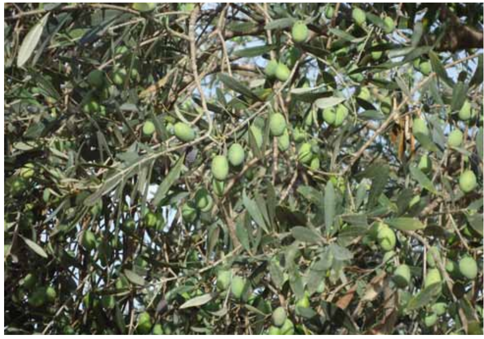
The implementation of advanced and sustainable irrigation systems are stabilizing crop yields and raising water productivity in the drylands of Morocco and Syria.