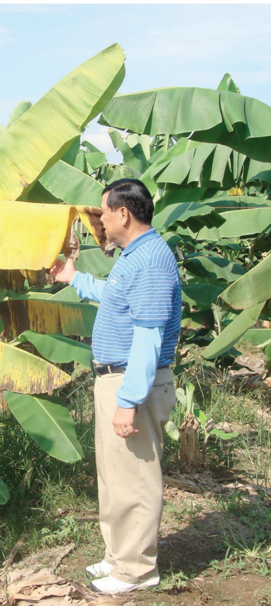
Fusarium wilt.

according to the risk of TR4 arrival and the rate of internal spread of the disease within the country. Key factors linked to the likelihood of TR4 to reach a country were identified from risk analyses conducted in Africa, Latin America and Asia. They included the importance of monocropped Cavendish bananas, global banana traffic to and from the country, quality of plant health border controls, risk of informal border crossings, rigor of internal plant quarantine measures, and land and other links to countries where TR4 is currently present. The rate of internal spread was subsequently estimated based on the rigor of internal quarantine measures, the importance of Cavendish bananas, and the importance of banana for national research investment and public policy. Differential rates of spread were proposed for the internal spread index by cultivar group. Initial rates of spread were proposed for the first five years with an increase of 50% in the rate for each successive five year block. In addition, a second scenario with a 25% increase was computed to determine sensitivity to the rate of spread.