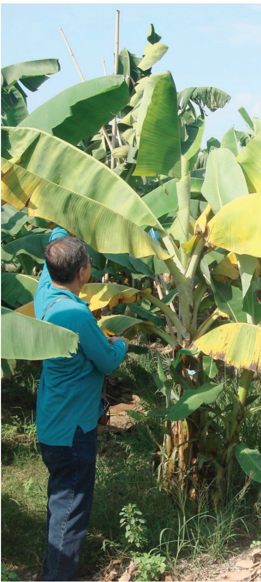
Yellow and wilted leaves are typical symptoms of Foc TR4.

Scientists at Bioversity International, within the framework of the CGIAR Research Program on Roots, Tubers and Bananas, have recently estimated the acreage, production losses and associated economic implications of Foc TR4 spread if no significant interventions are instituted in the next 20 years (Scheerer et al 2016). They used a TR4 risk of spread scale to categorize countries