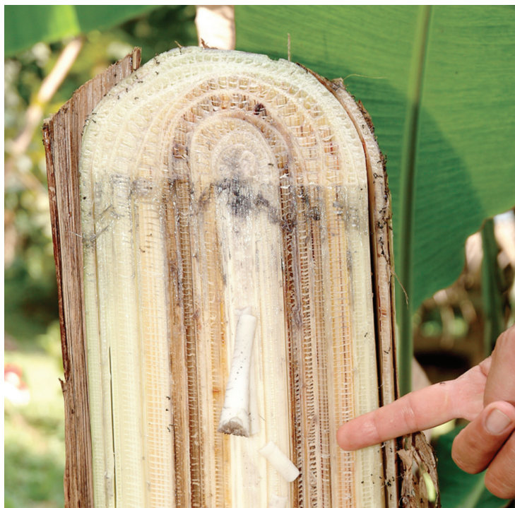
Cross-section of the pseudostem showing the reddish to dark brown discolouration typical of Fusarium wilt.

This analysis provides a rapid first estimate of the possible future spread of Foc TR4 and the quantified losses using a transparent index approach based on expert estimates. Emerging scientific results can be incorporated easily into the calculations, e.g. cultivar susceptibility still being conducted, with new results expected in the next few years. In order to fine-tune the model, further expert feedback and field studies are needed. More complete bio-economic and spatial models would serve to target investments into exclusion measures and research in recovery practices. In the meantime, use will be made of the results above to engage the global, regional and national stakeholders in an effort to raise awareness about the catastrophe in-the-waiting as posed by Foc TR4, and to appeal for definitive actions to be taken immediately.