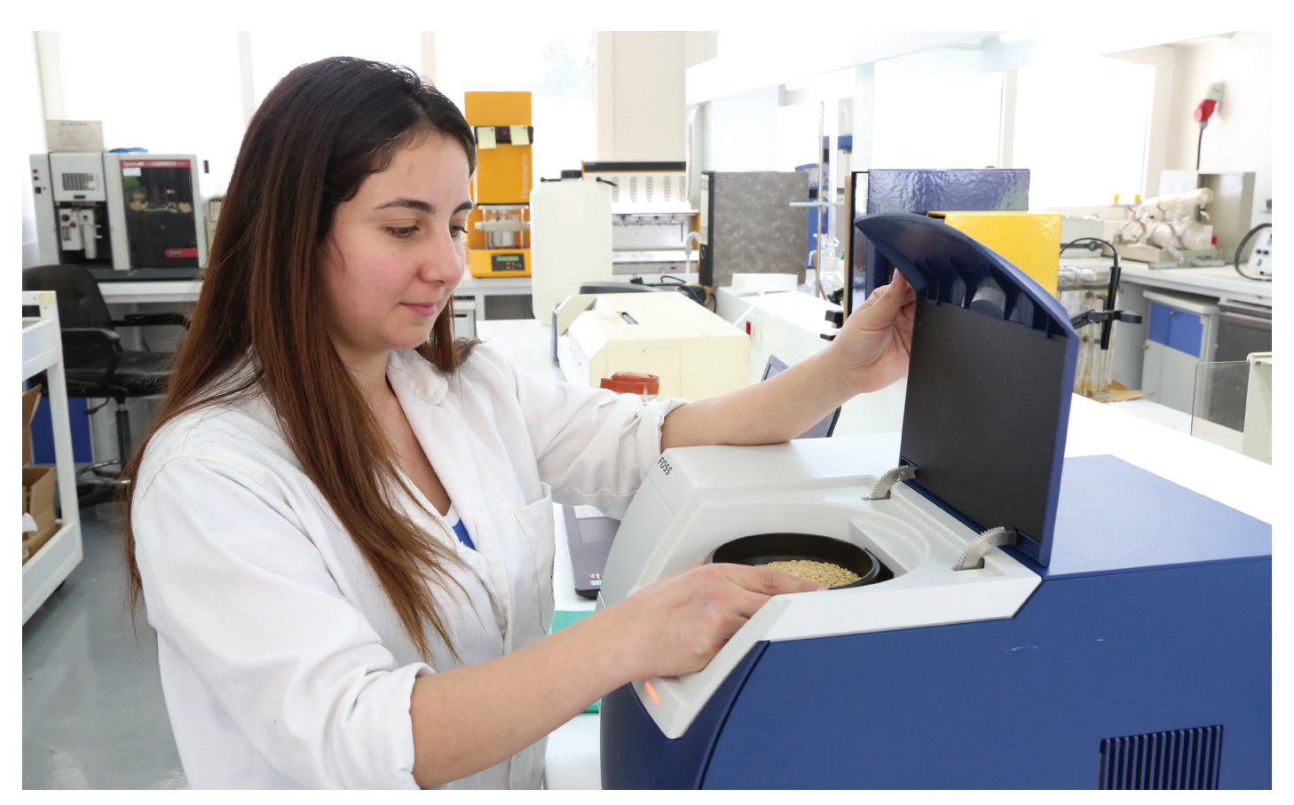
An engineer from LARI-Lebanon analyses fodder materials as a part of a project funded by AFESD