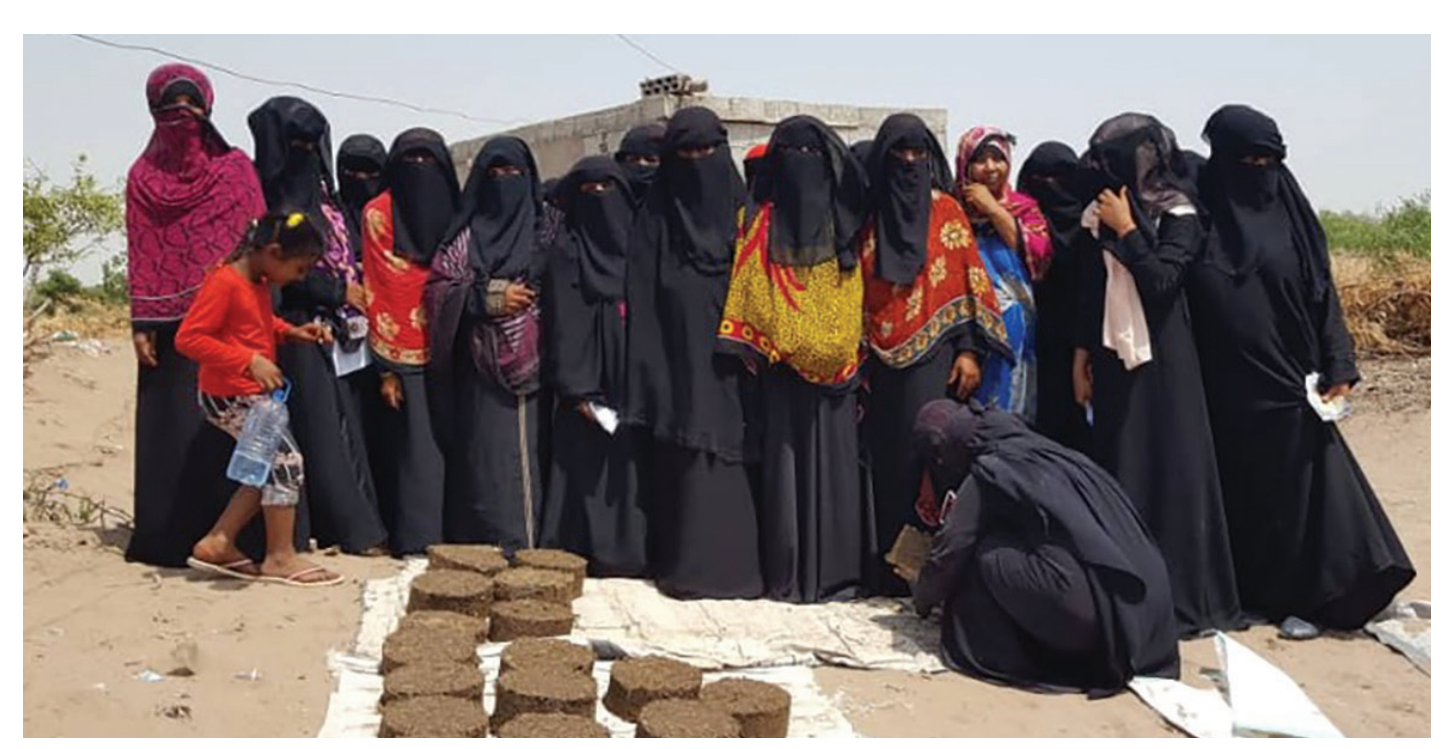
Training women farmers in Yemen on fodder production