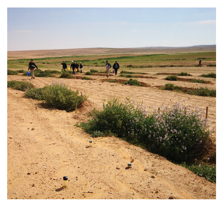
Demonstration site for sustainable rangeland management in arid regions