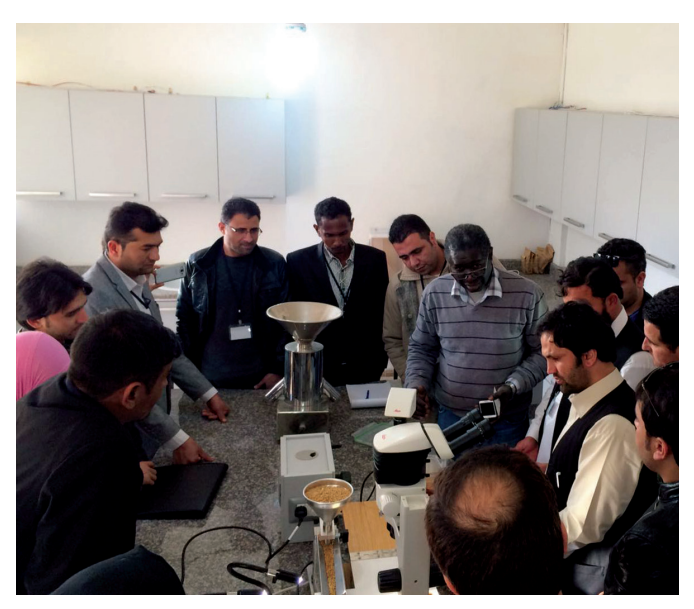
Seed quality-control training

Global biotechnology research continually evolves so the Fund and ICARDA have continued to strengthen national efforts. With the introduction of international biosafety regulations for the safe development, introduction and use of genetically modified crops, in 2007 the Arab Fund supported further improvement through the development of a containment facility at ICARDA. This provided the basis for advanced research and testing of genetically modified crops in the Arab world. By doing so, Arab countries can harness and contribute to the most globally advanced genomic and genetic engineering tools for crop improvement.