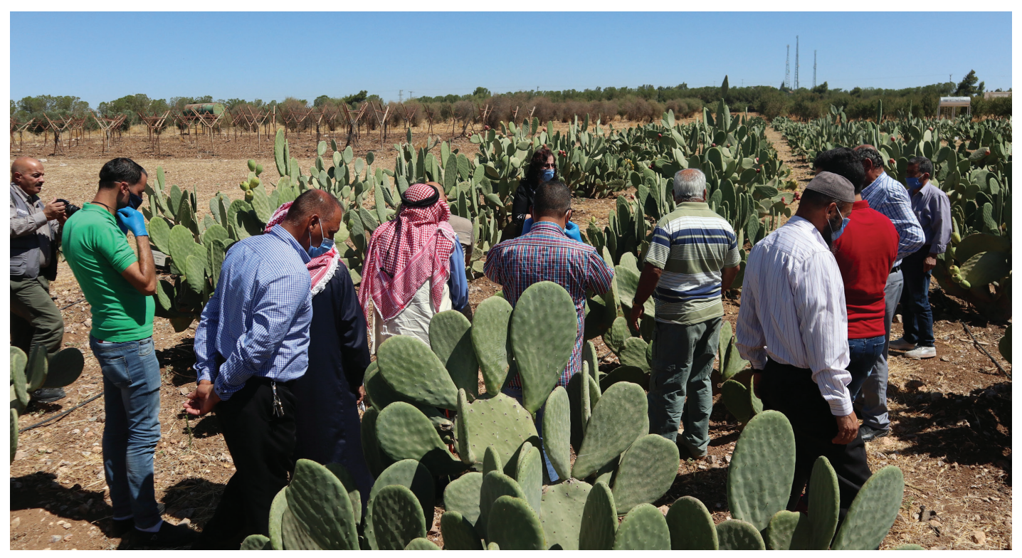
Field visit to the cactus pear genebank

A memorial plaque for the biosafety facility at ICARDA headquarters in Syria which was built with financial support from AFESD