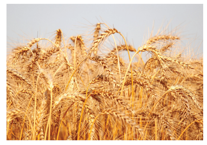
Demonstration plot for an improved variety of bread wheat at harvesting stage