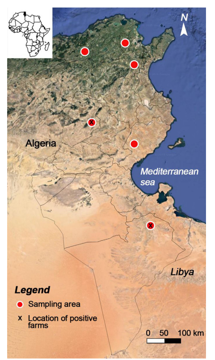
FIGURE 1 Map of Tunisia showing the location of sampled and positive farms where ELISA seropositive ewes to Crimean–Congo haemorrhagic fever virus were detected